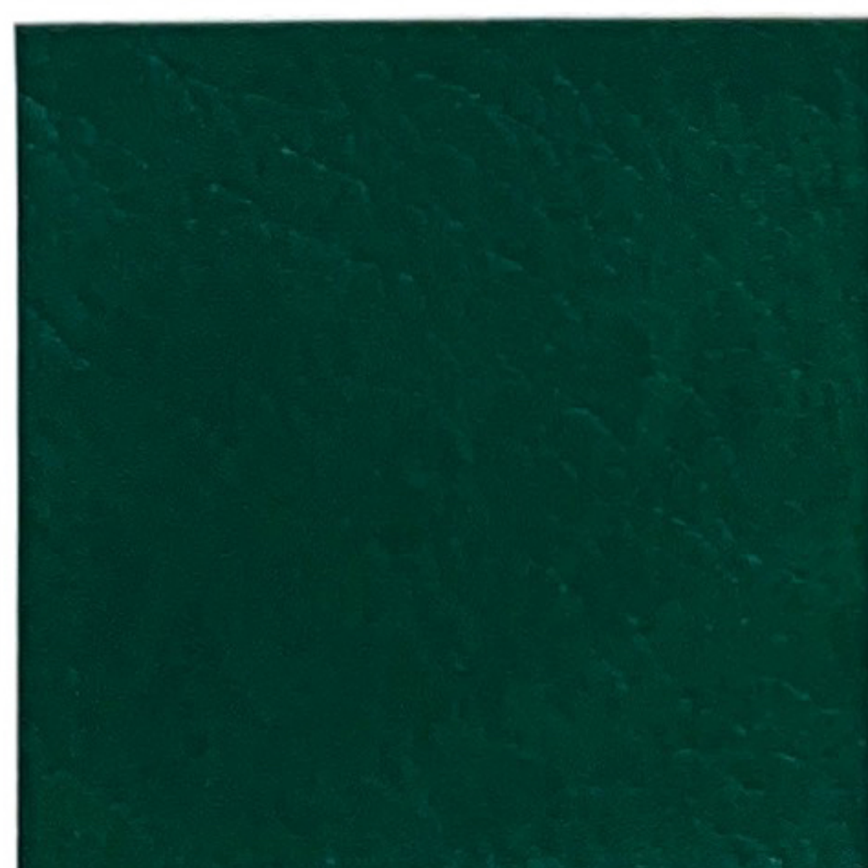
BB 67 Vine