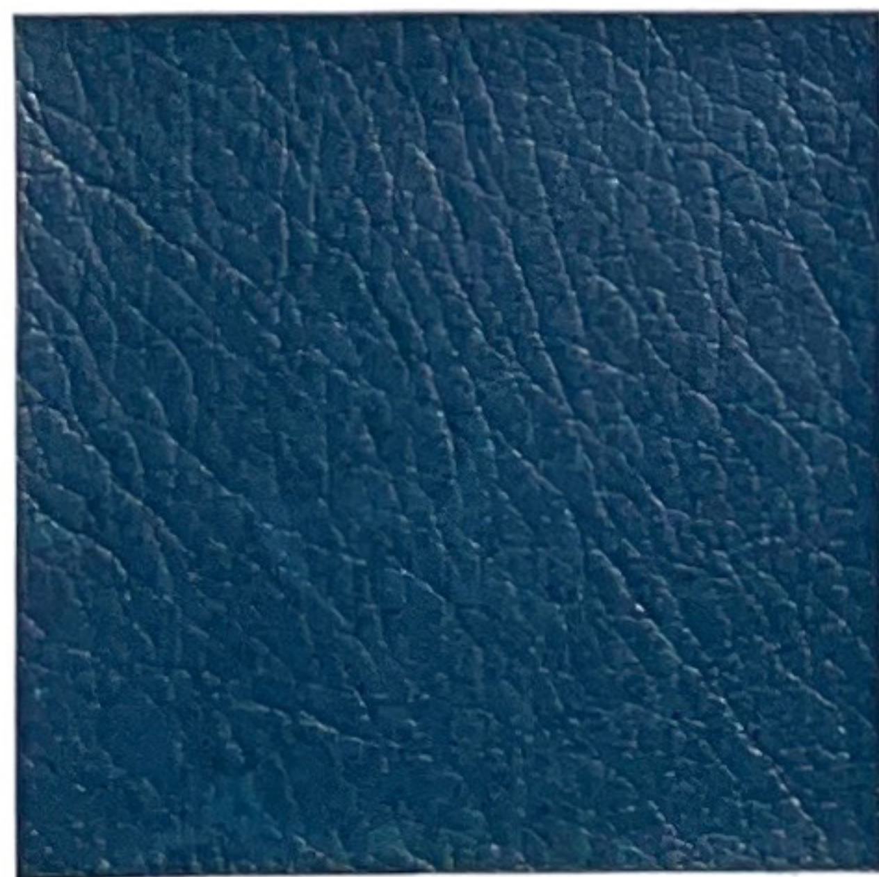
BB 60 Dusk