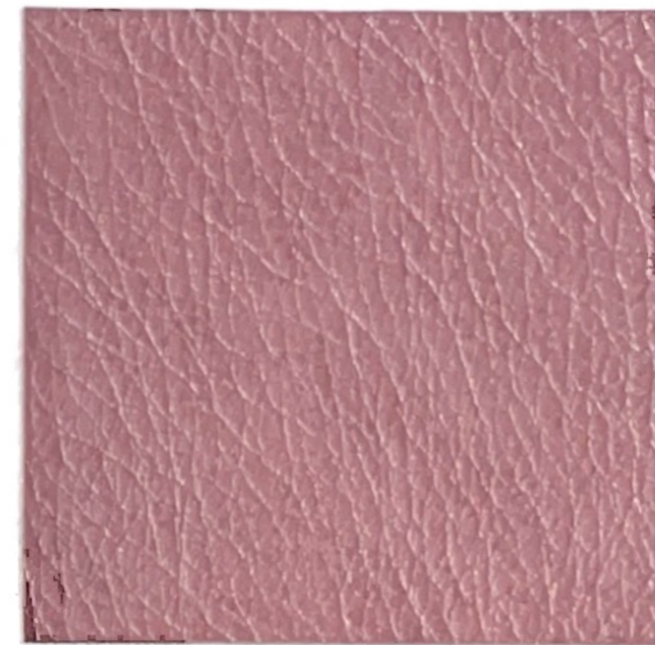
BB 63 Mauve