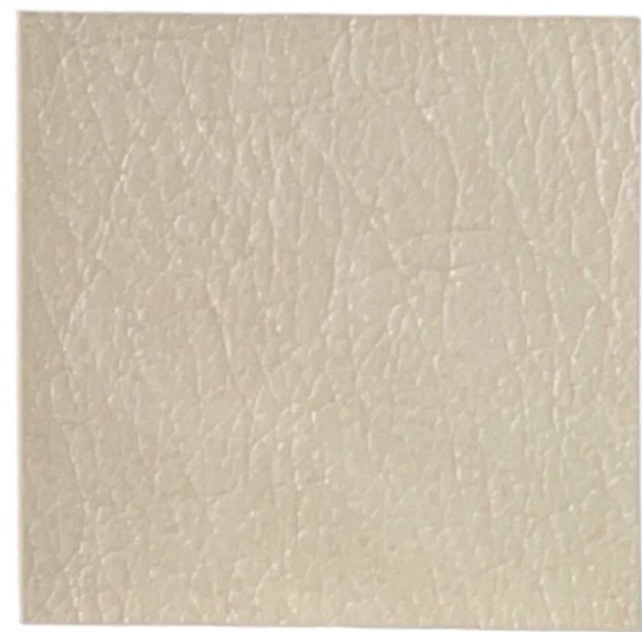
BB 52 Ash