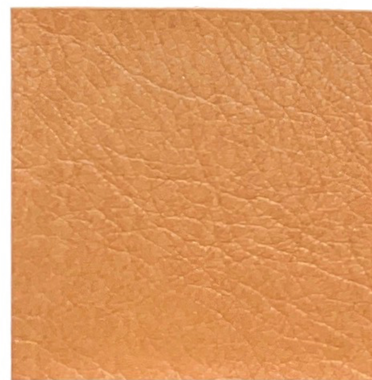
BB 56 Copperwood