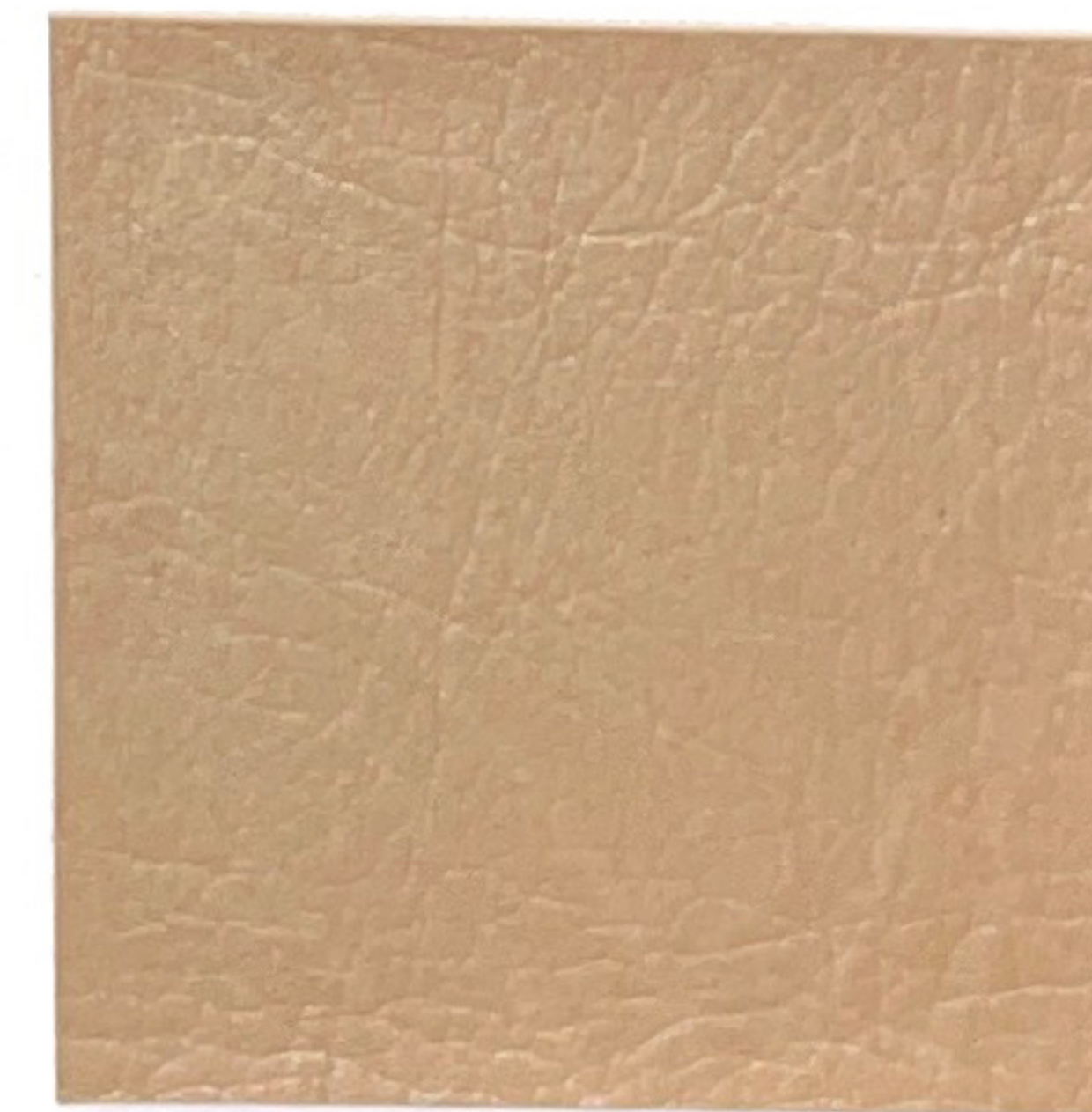
BB 54 Wheat