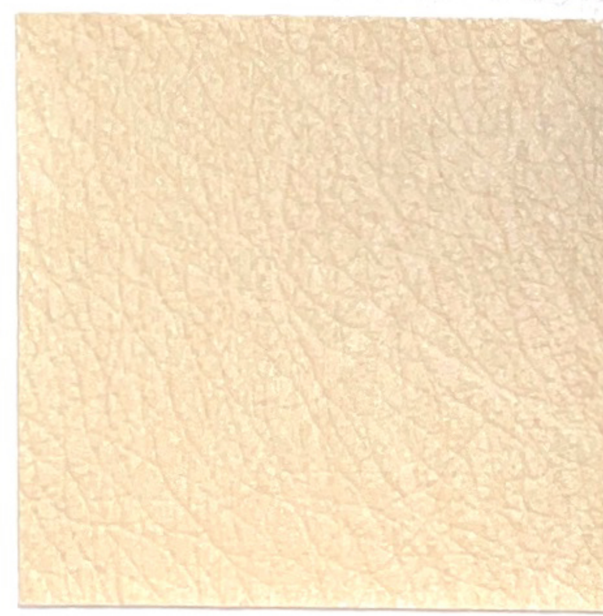
BB 55 Bisque