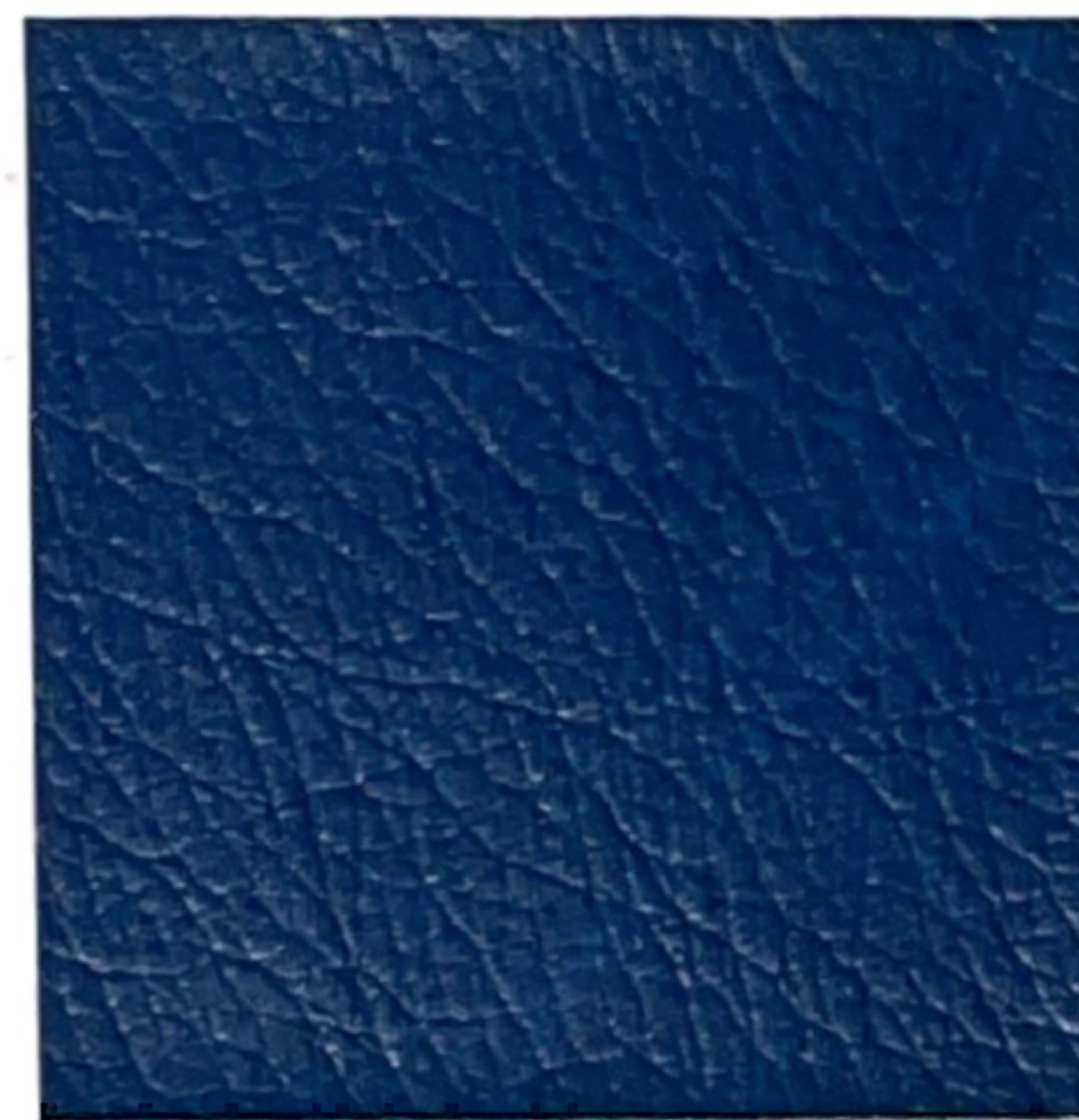
BB 61 Royal Navy