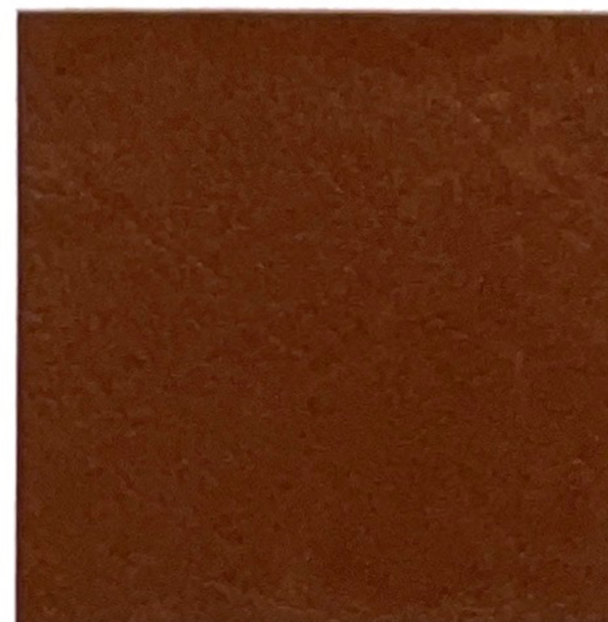
BB 51 Brandy