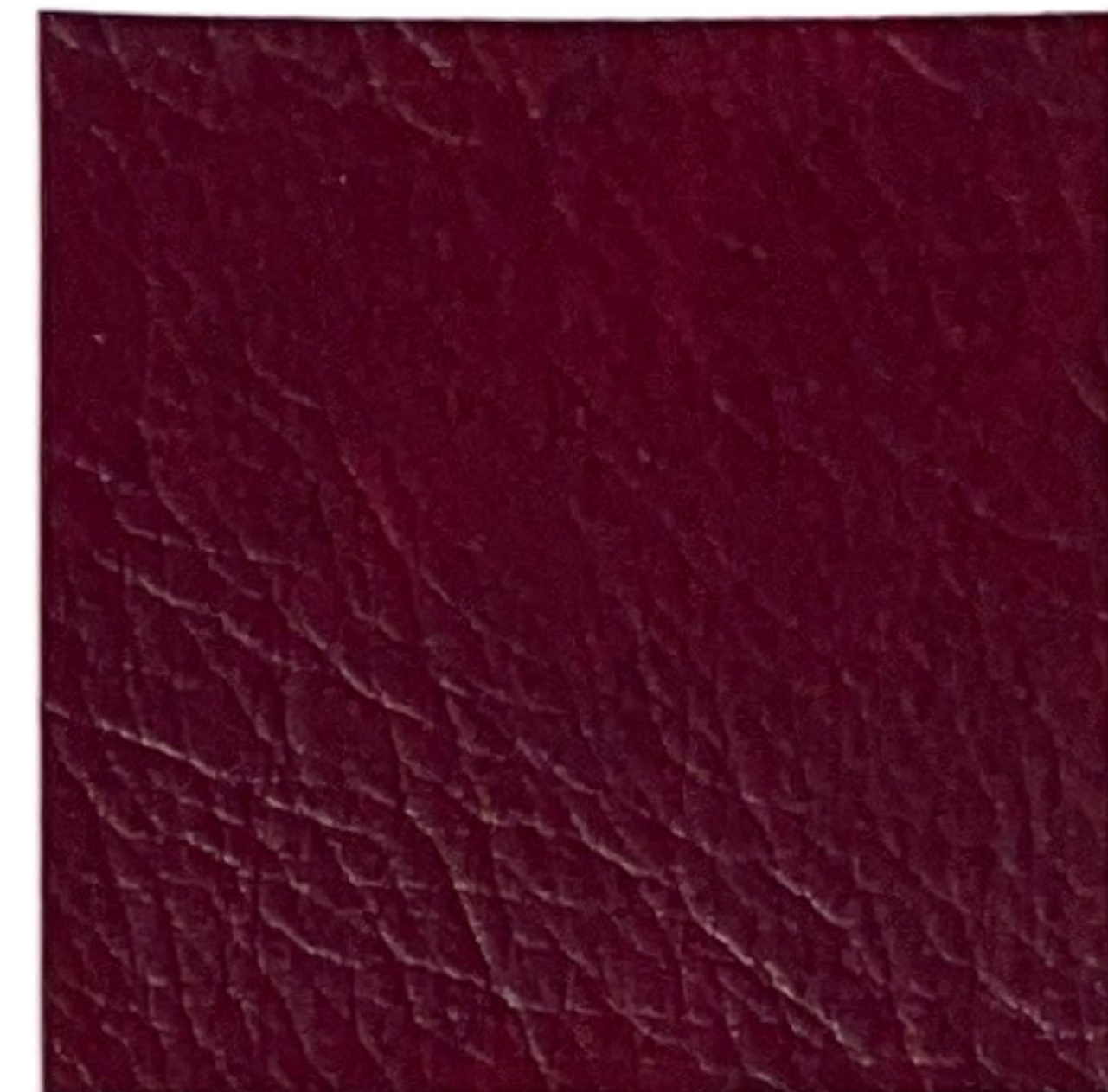
BB 62 Burgundy