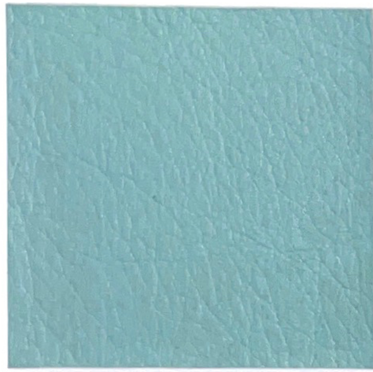
BB 66 Laurel