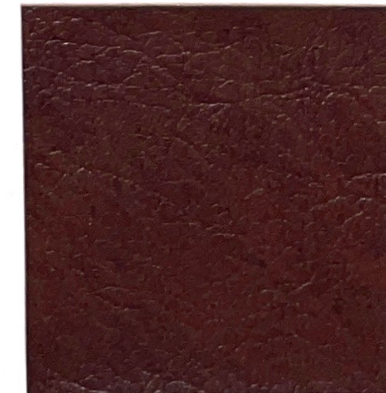
BB 57 Florentine Brown