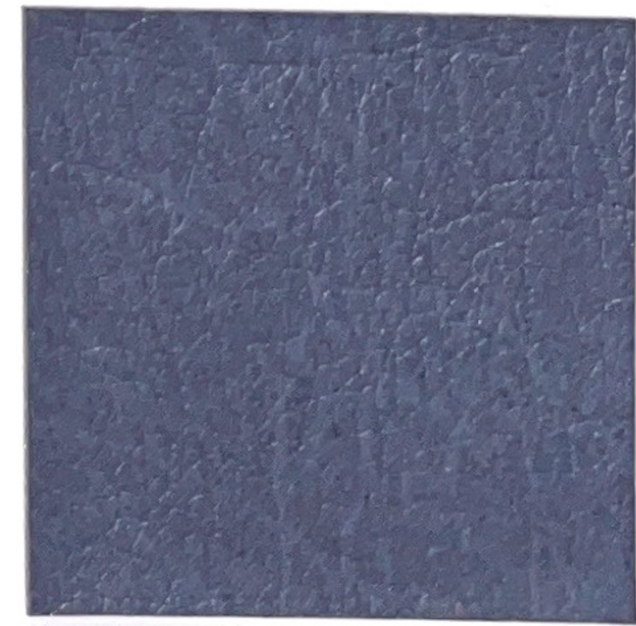
BB 58 Sterling