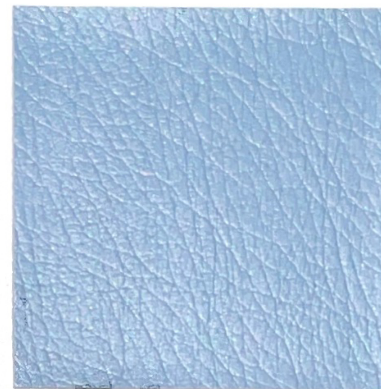
BB 64 Delft