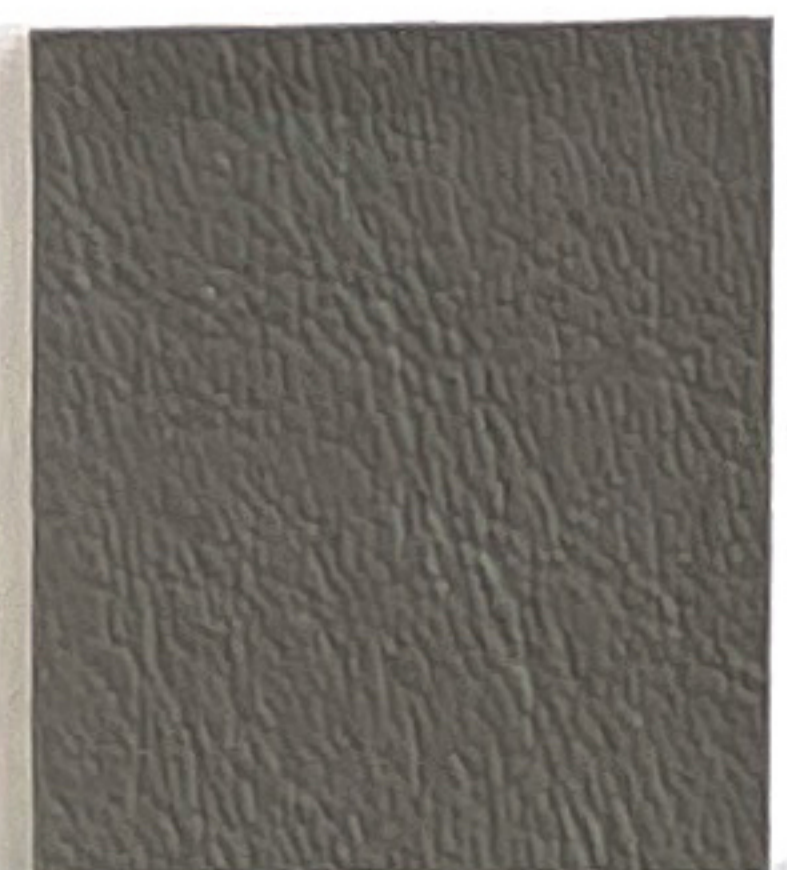
CY 22 Lt. Gray