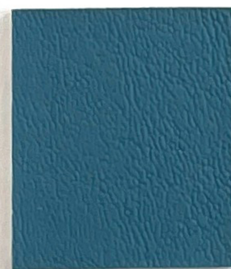
CY 32 Sea Glass