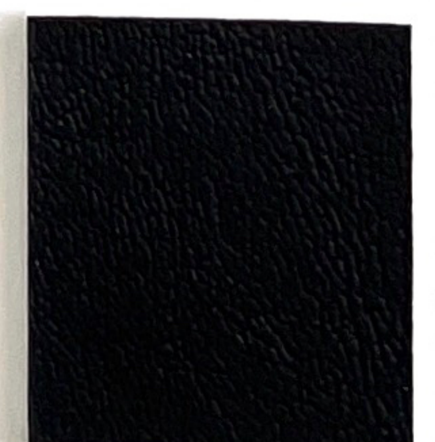
CY 18 Black