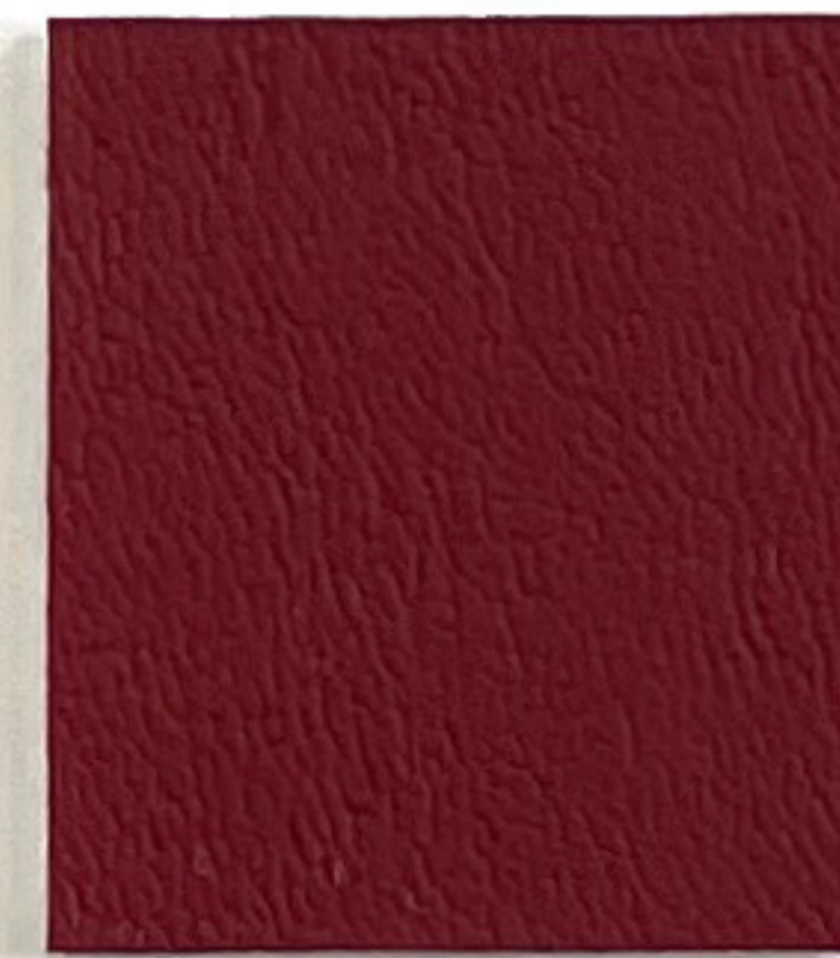
CY 03 Red