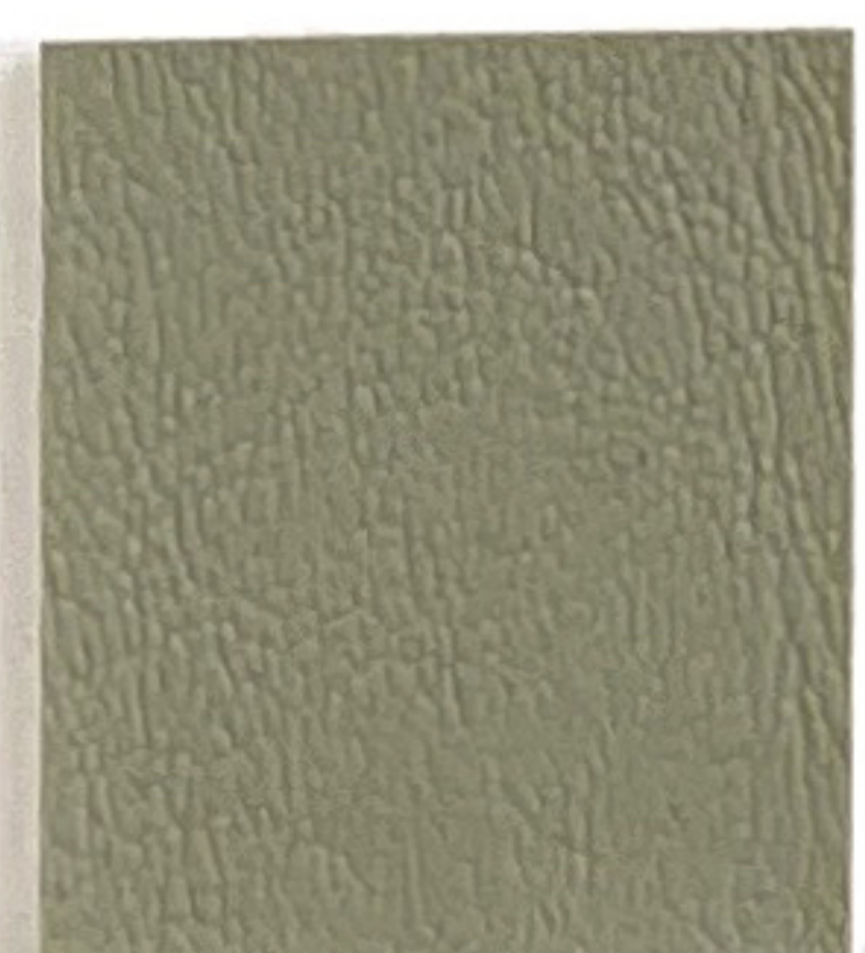
CY 10 Palm