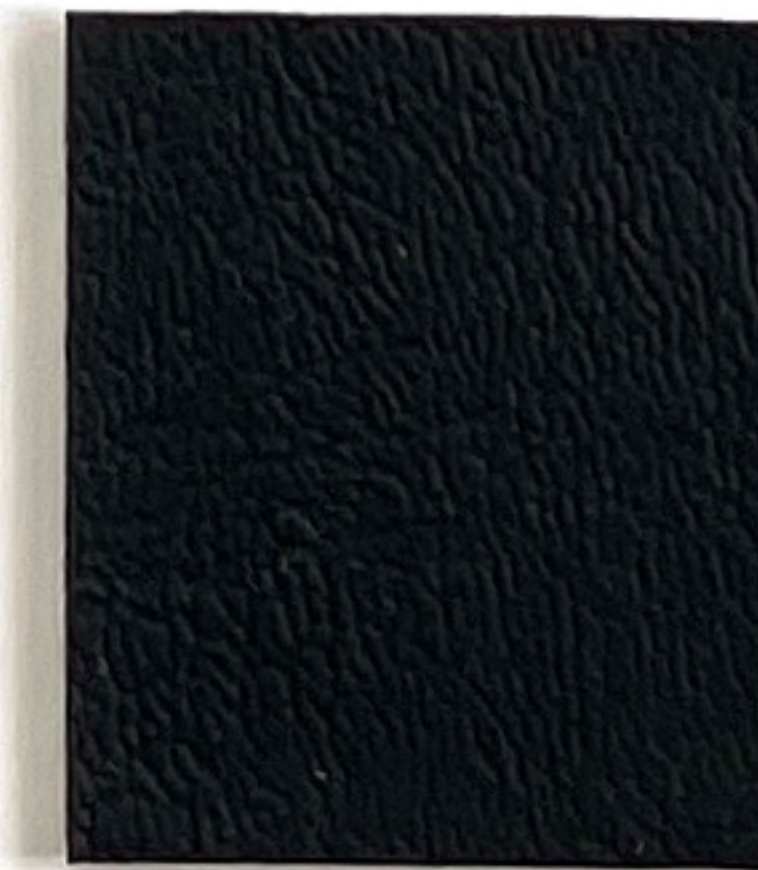
CY 01 Graphite Grey