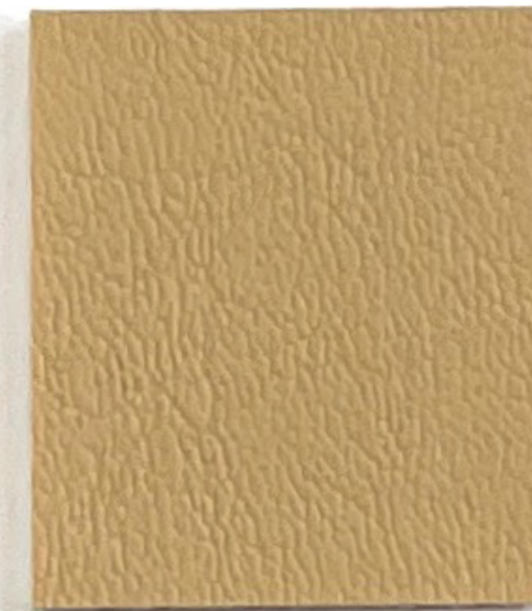
CY 02 Stardust