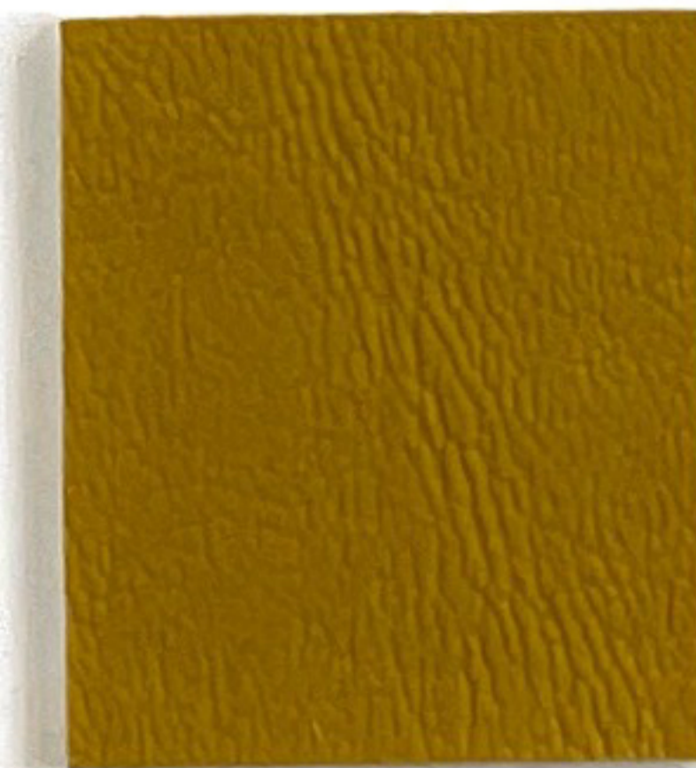
CY 23 Amber