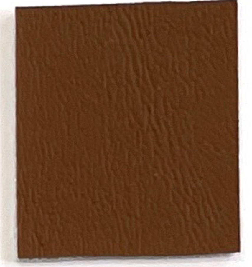
CY 13 Chaps