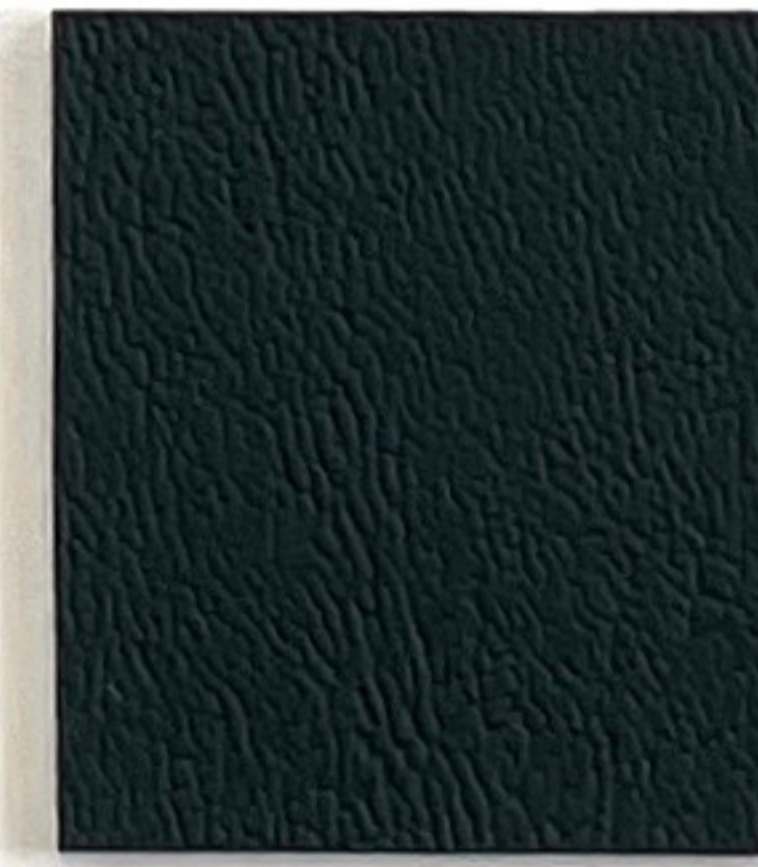
CY 16 Spruce