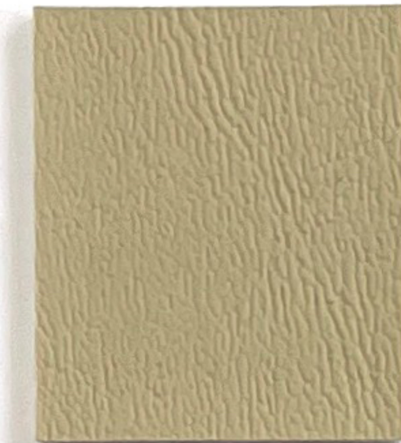
CY 05 Sunlight