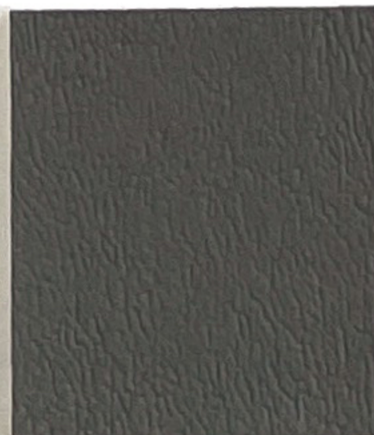
CY 21 Dk. Pewter