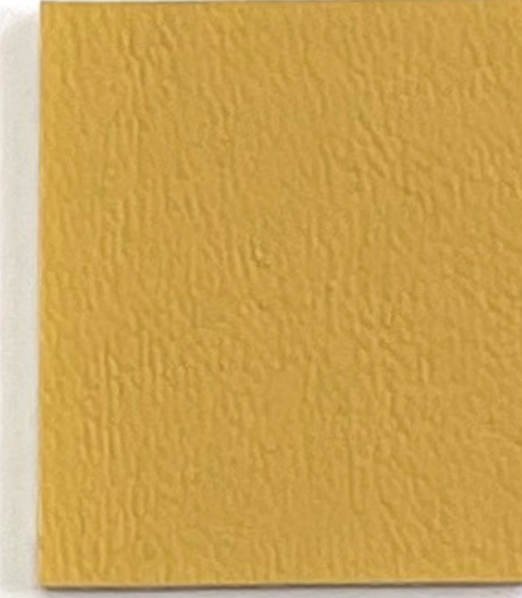
CY 07 Butter