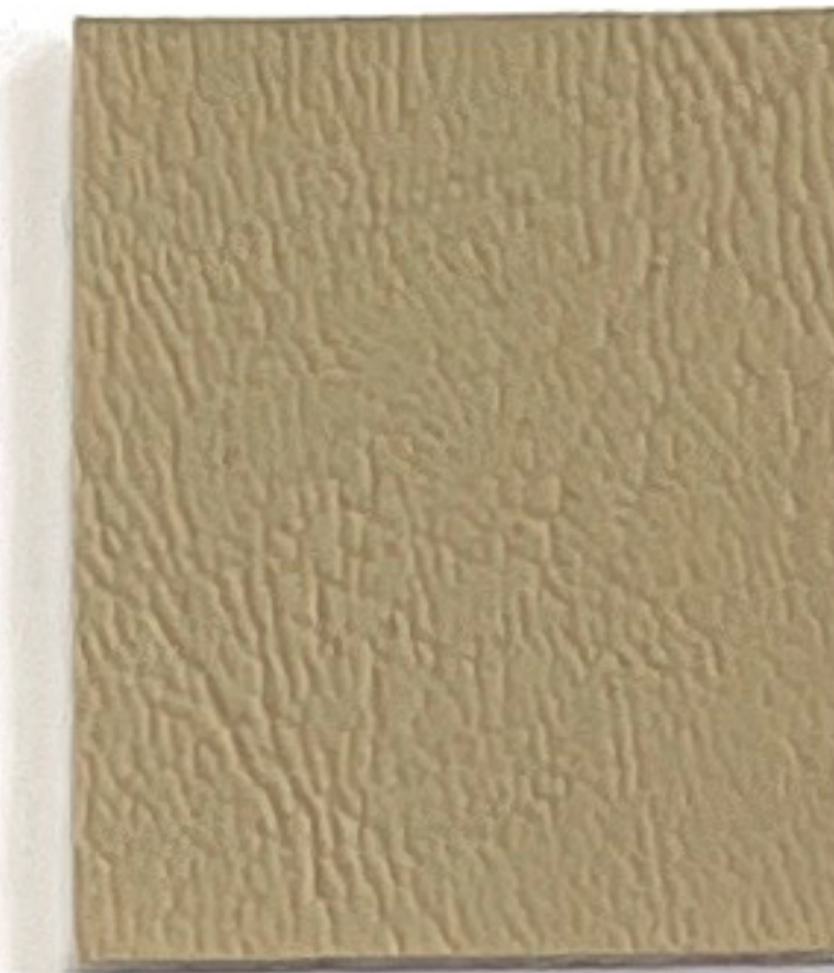
CY 12 Sand