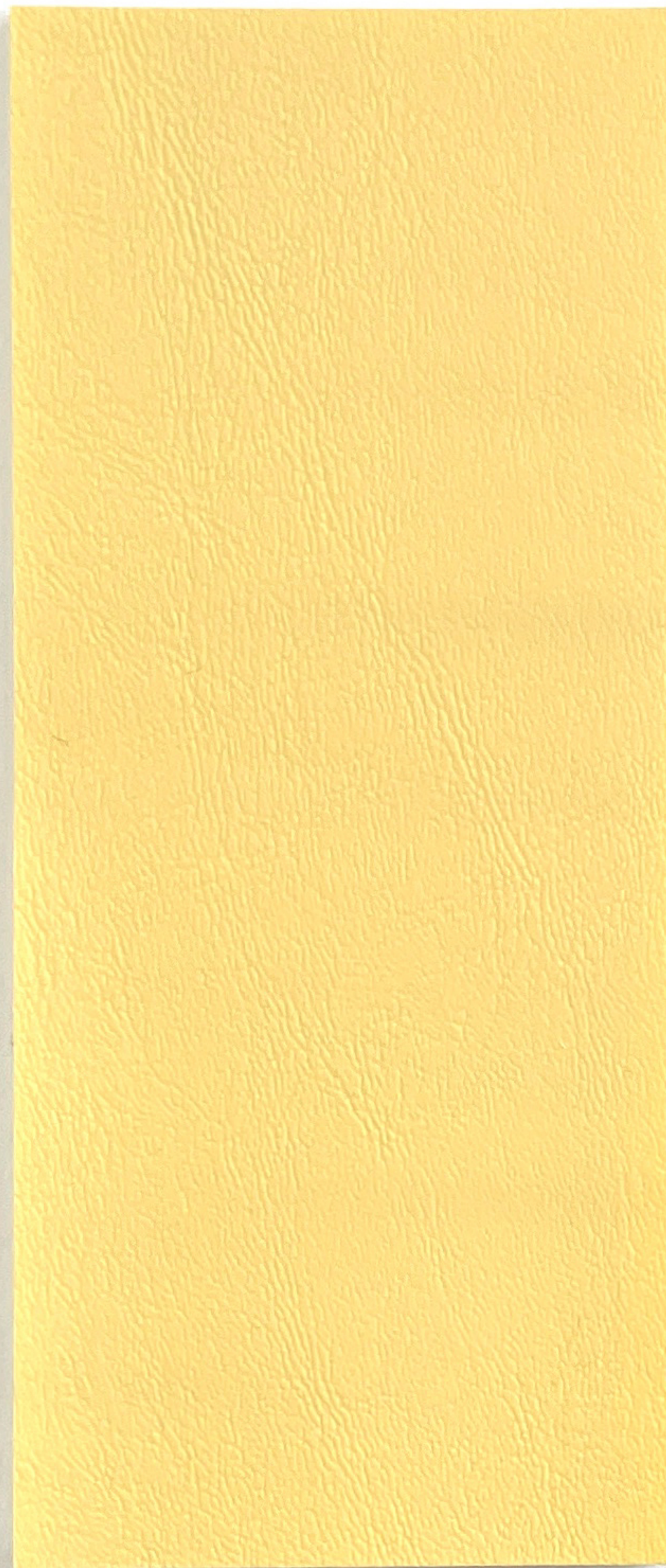
CY 25 First Light