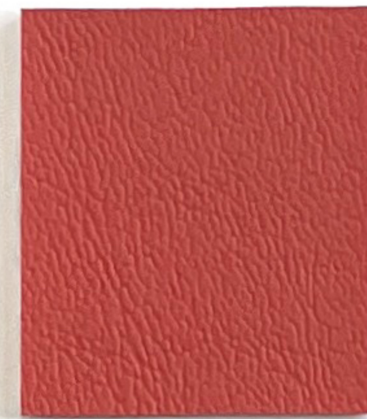
CY 28 Melon