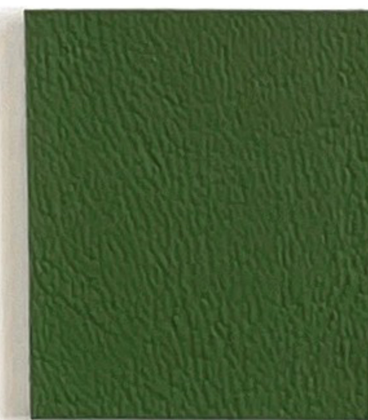
CY 35 Valley