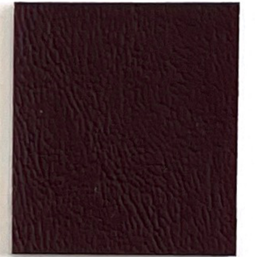
CY 14 Mahogany