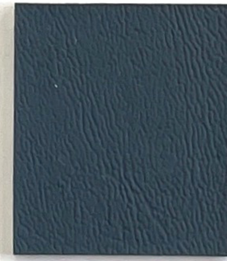
CY 09 Water