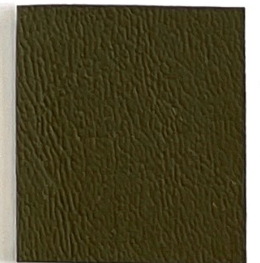
CY 30 Cyprus