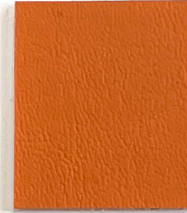
CY 27 Marmalade