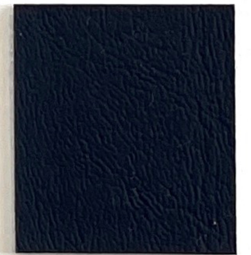
CY 17 Navy