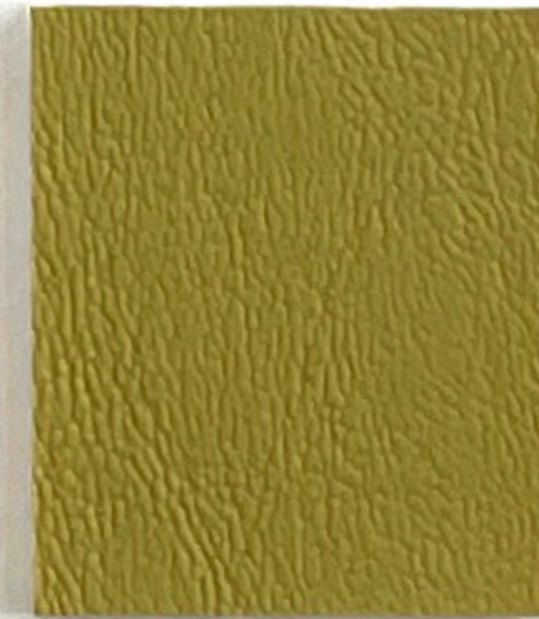
CY 24 Eden