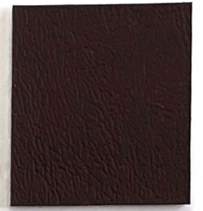
CY 08 Baja Brown