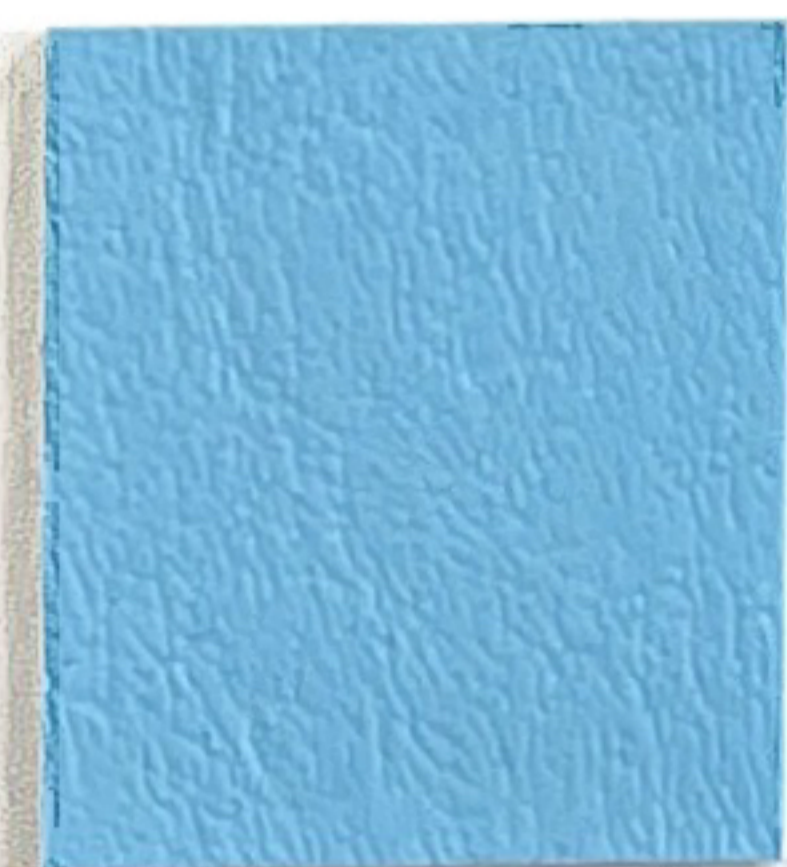
CY 29 Ocean