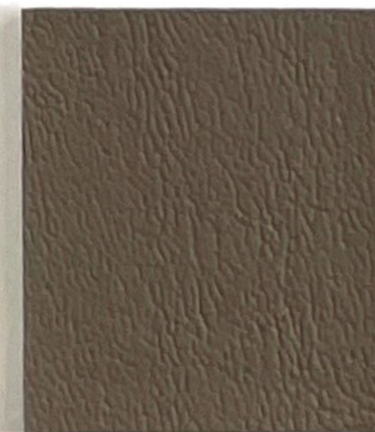
CY 19 Antelope