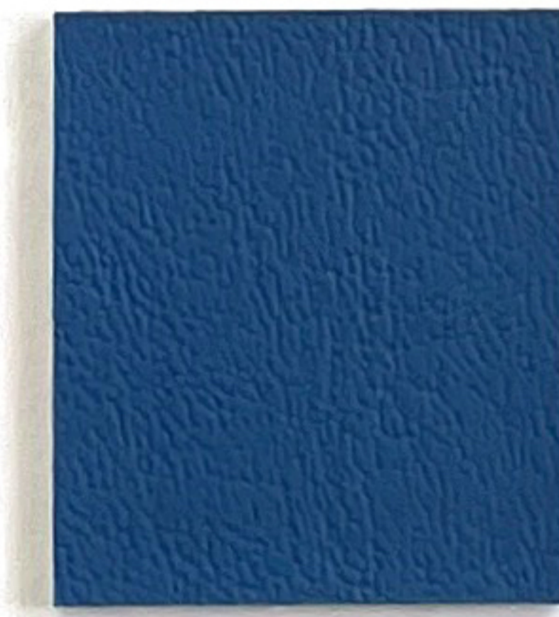
CY 26 Honesty