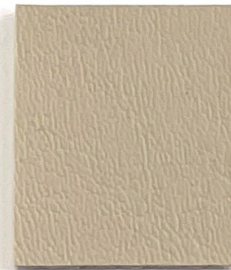
CY 15 Buff