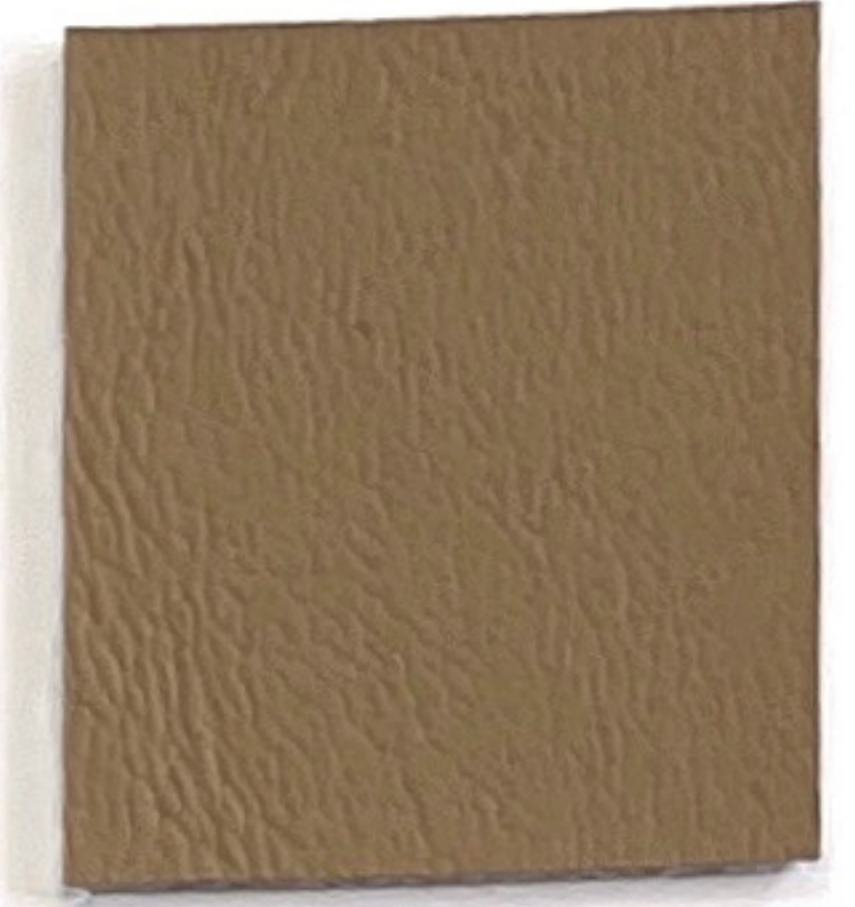
CY 04 Beach