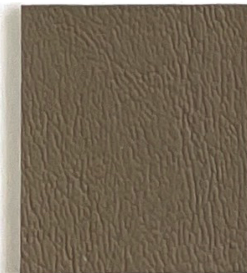
CY 06 Stone