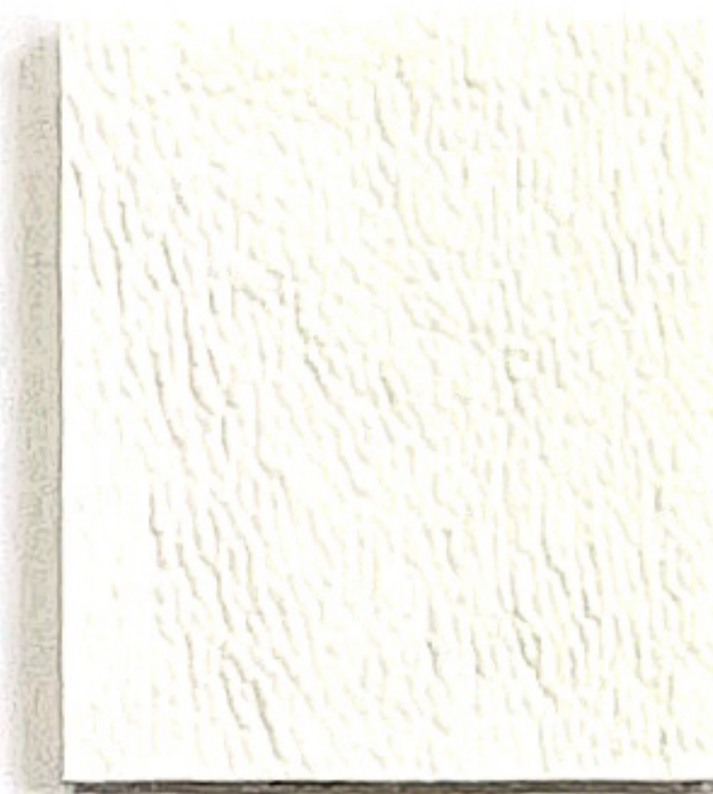
CY 20 Soft White