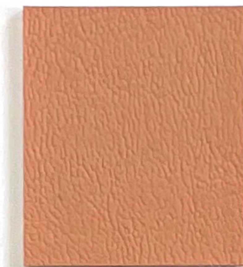
CY 34 Spice