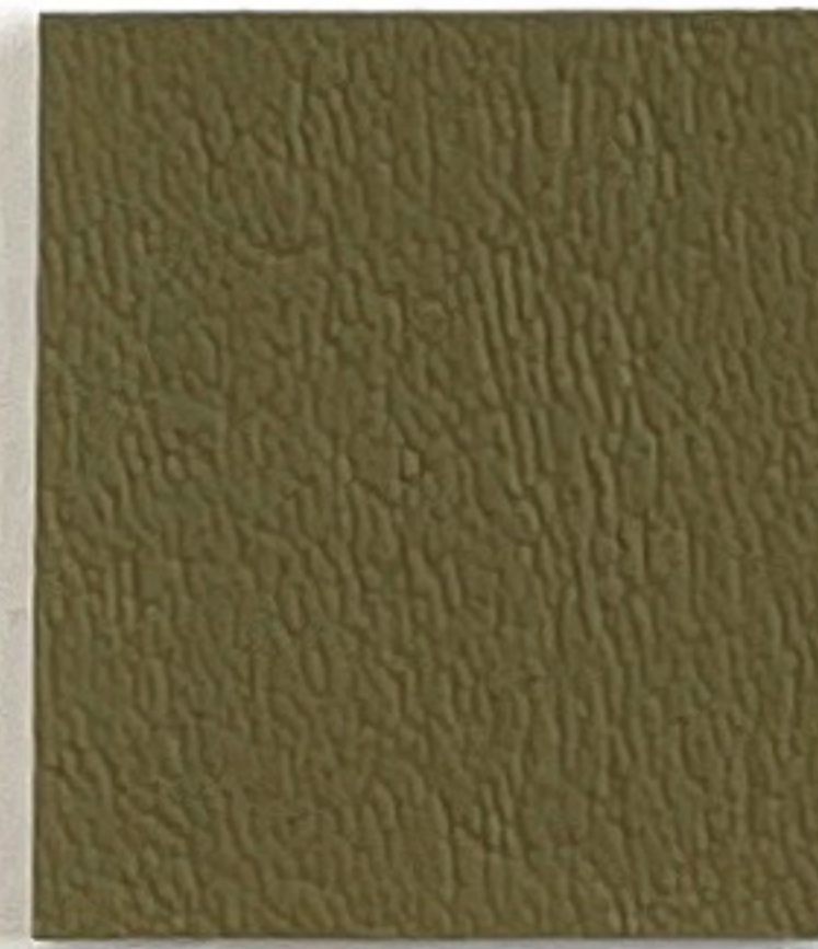
CY 11 Olive