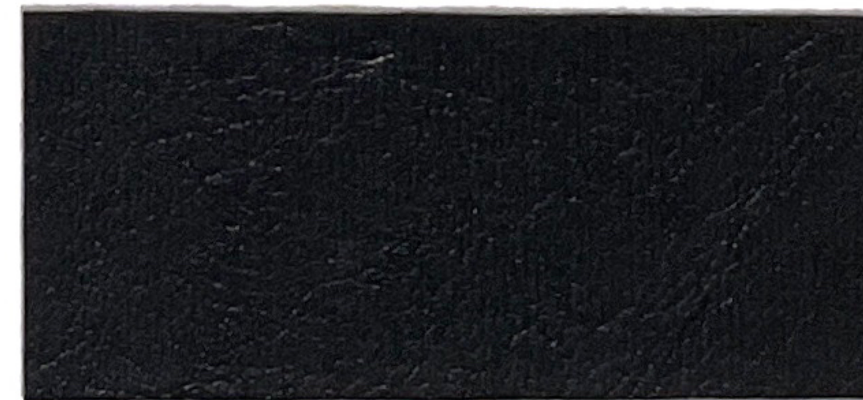
DOL 87 Blackwatch