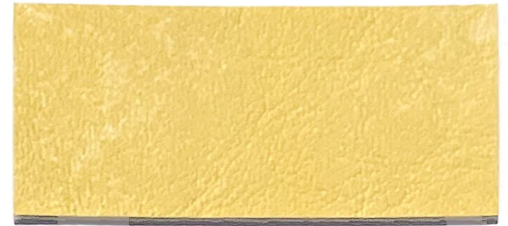
DOL 78 Citrus