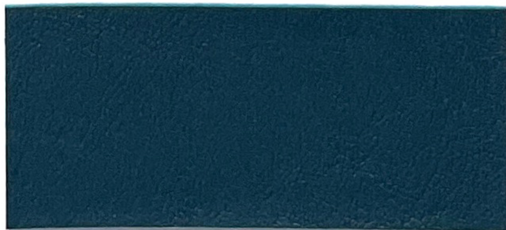
DOL 88 Nile Blue