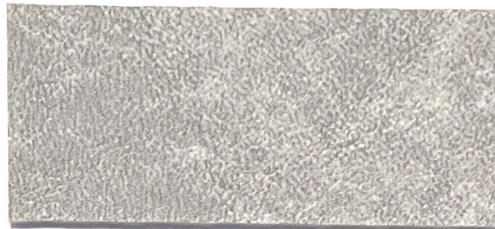
DOL 81 Seamist