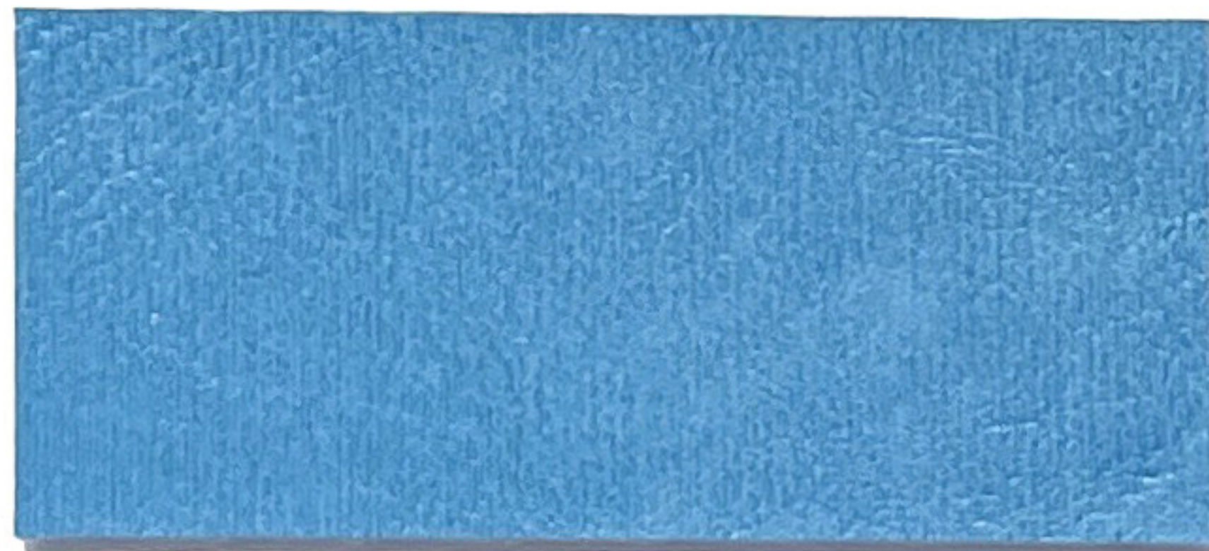
DOL 82 Lt. Blue