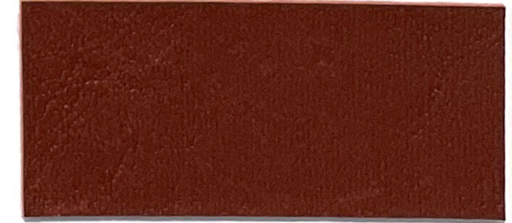
DOL 89 Terra Cotta