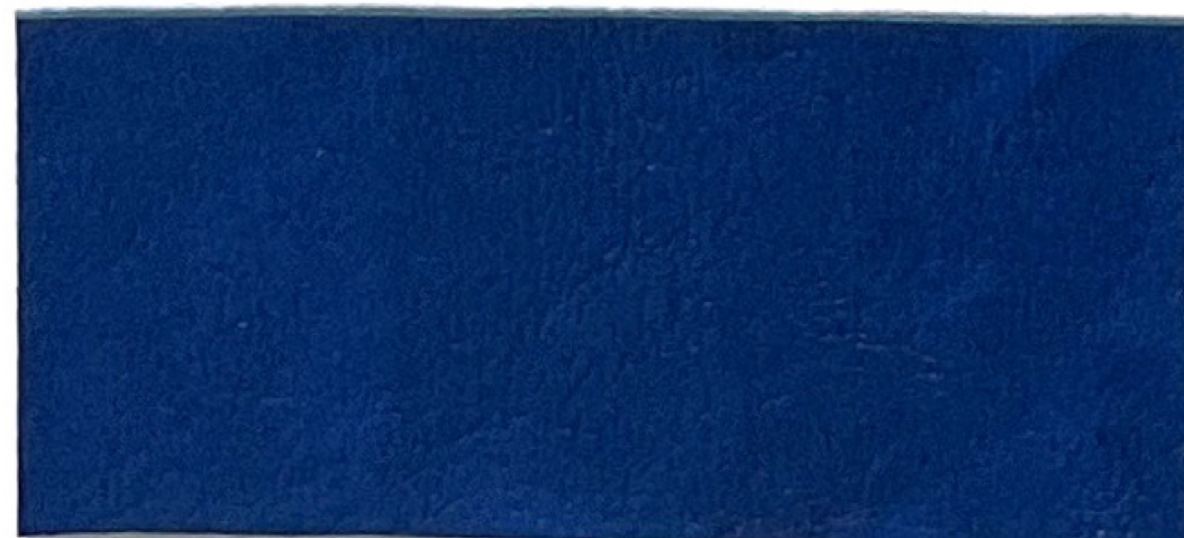
DOL 76 Navy