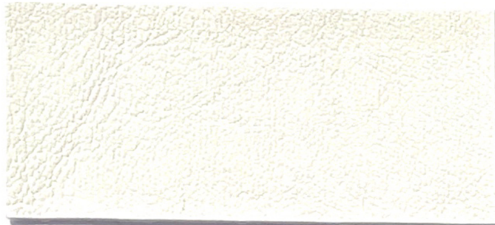
DOL 72 White