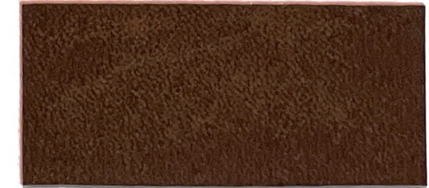
DOL 74 Teak