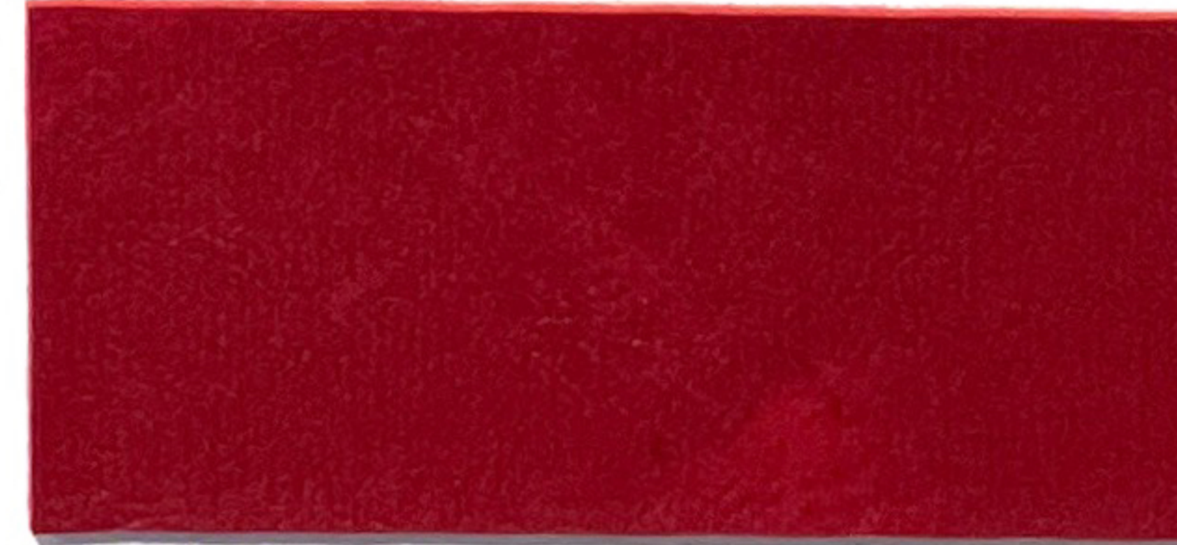
DOL 80 Burgundy