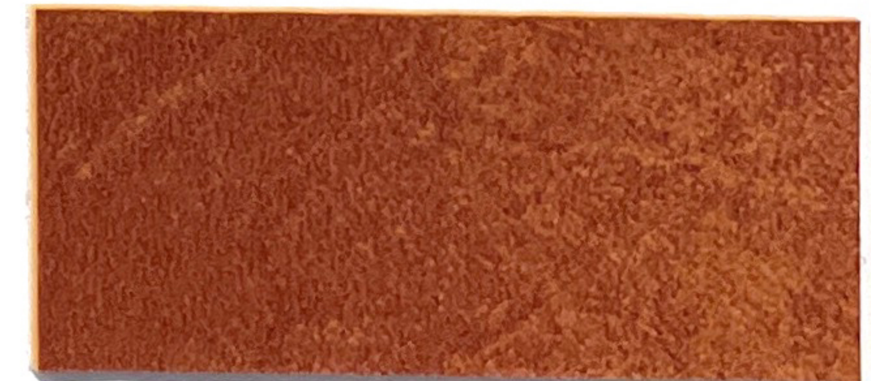
DOL 77 Walnut