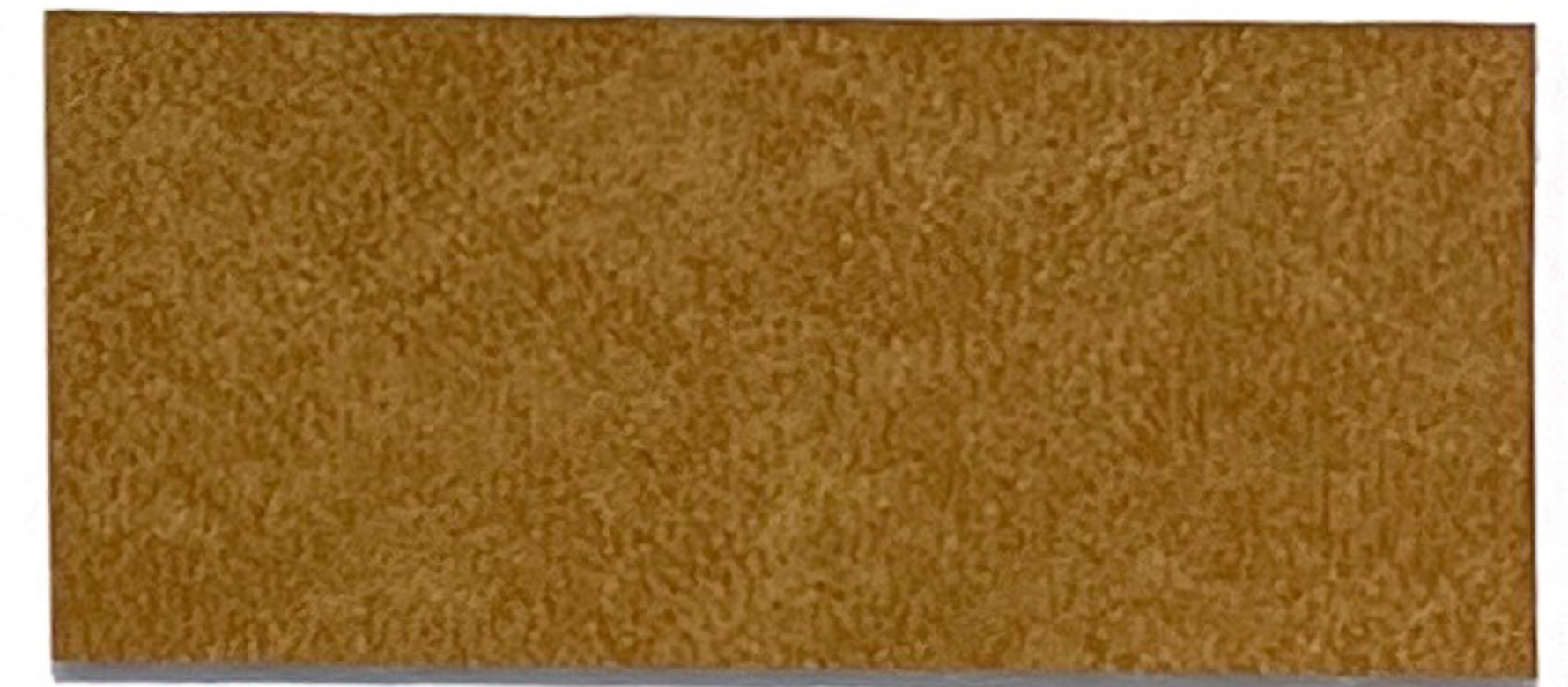
DOL 73 Bark