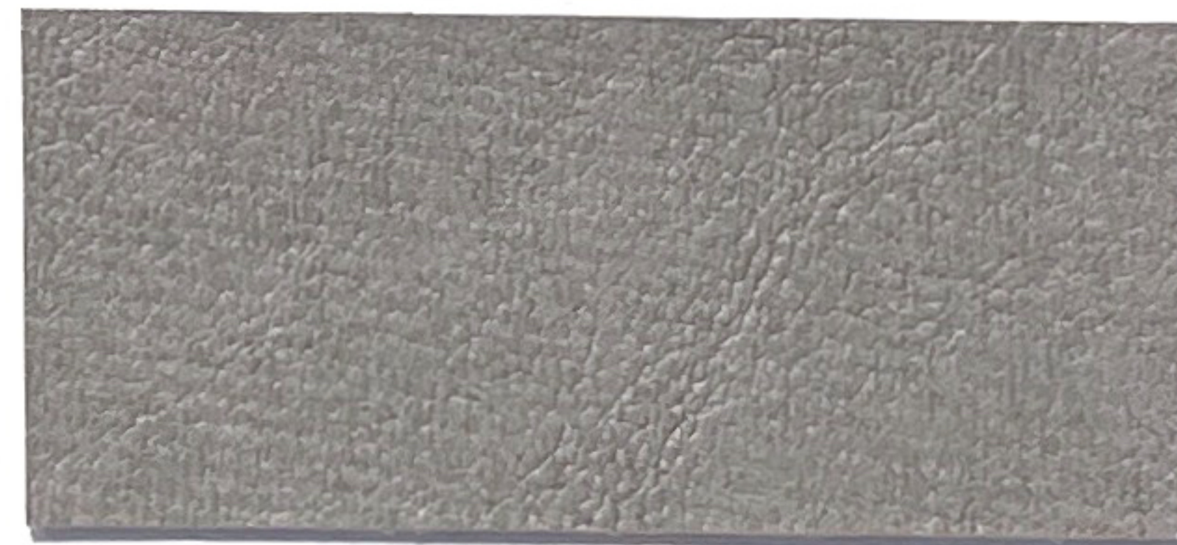
DOL 92 Dover Mist