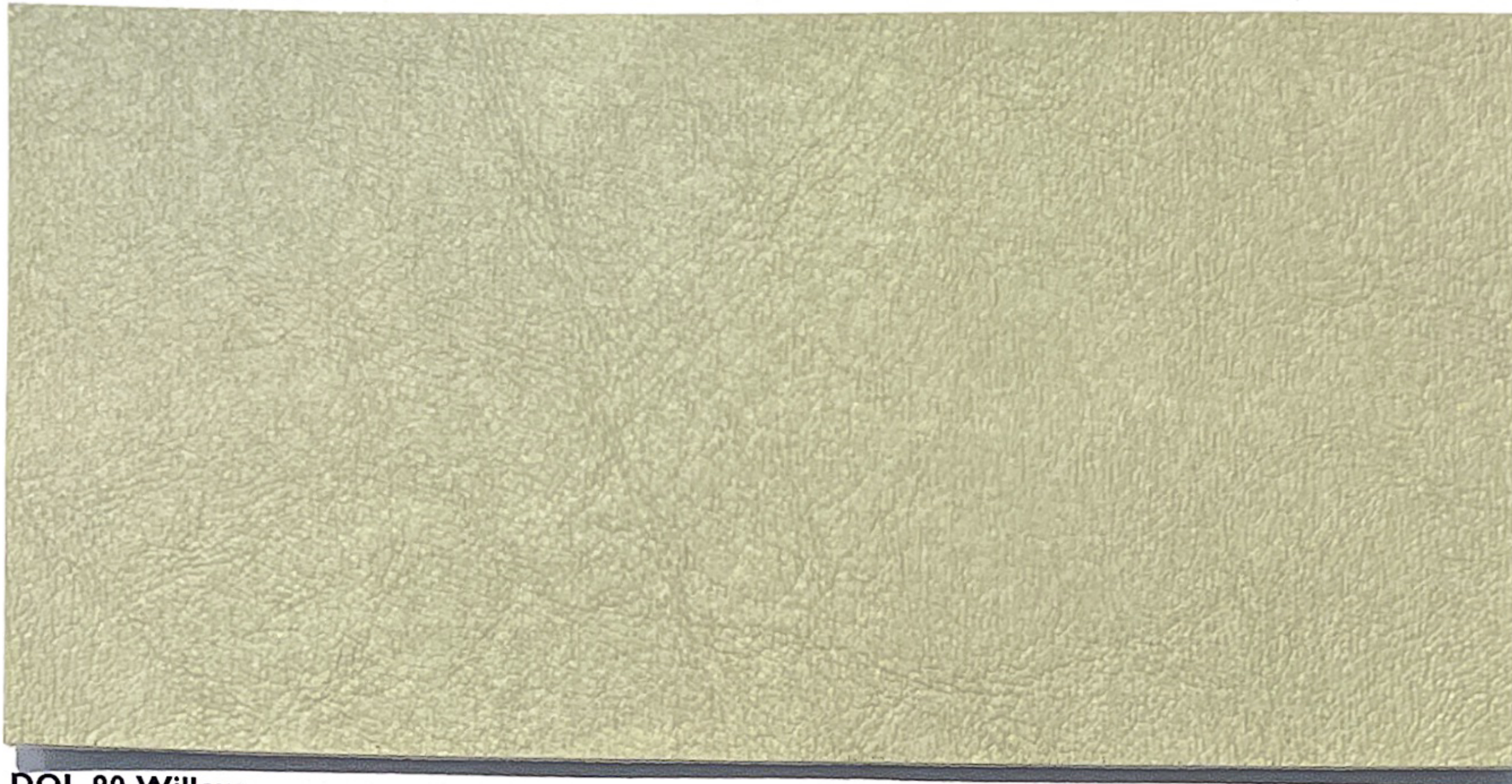
DOL 90 Willow