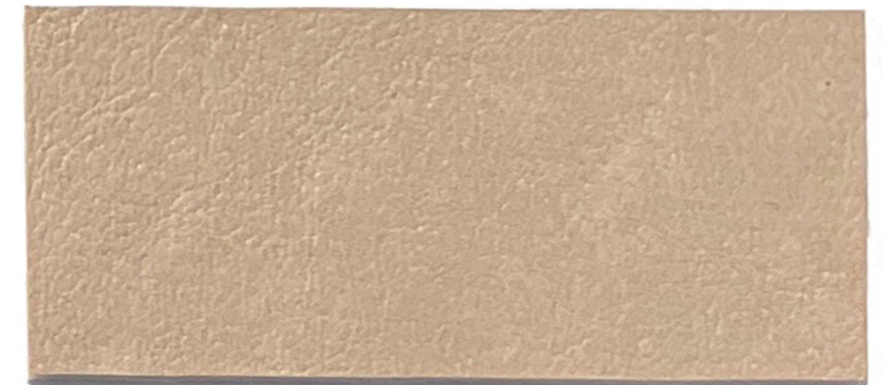
DOL 91 Smokewood