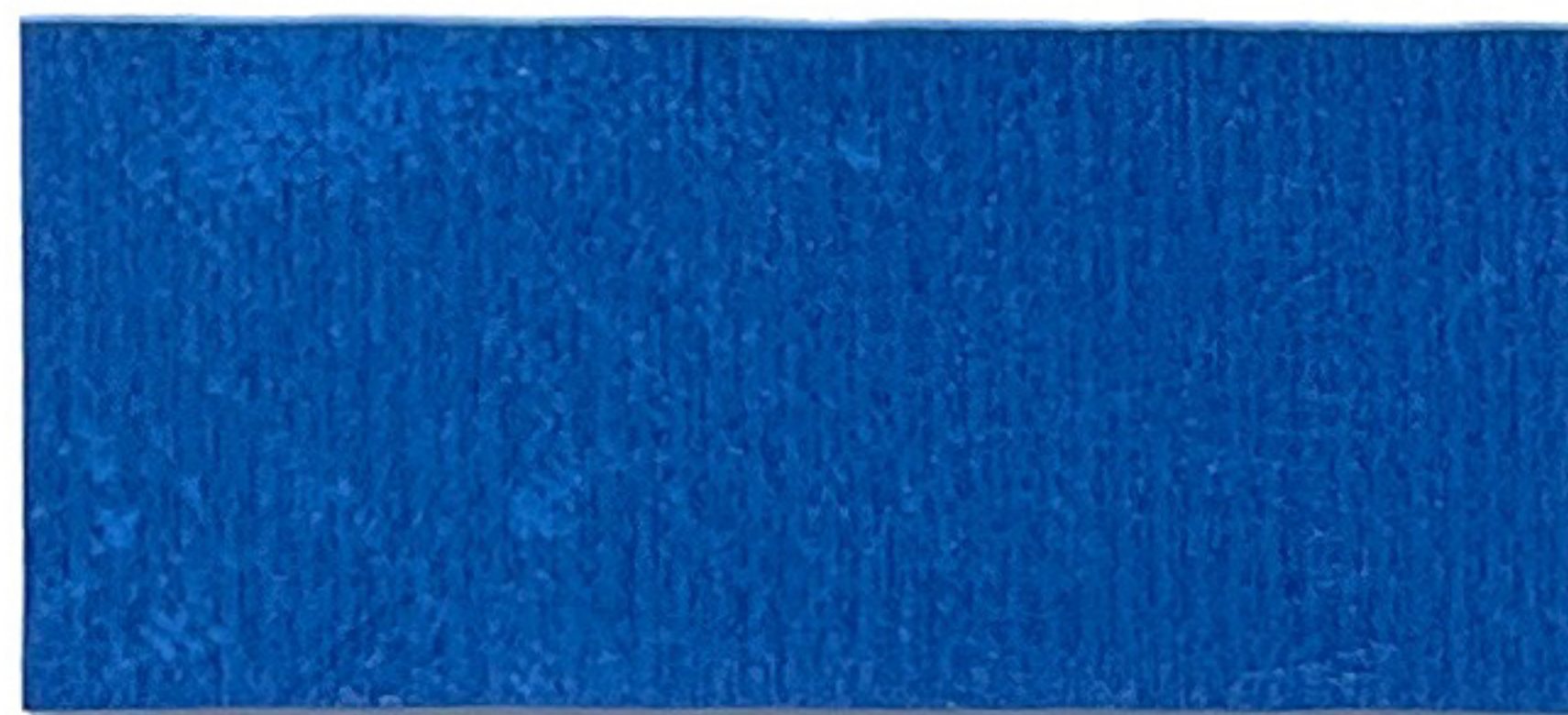
DOL 71 Blue