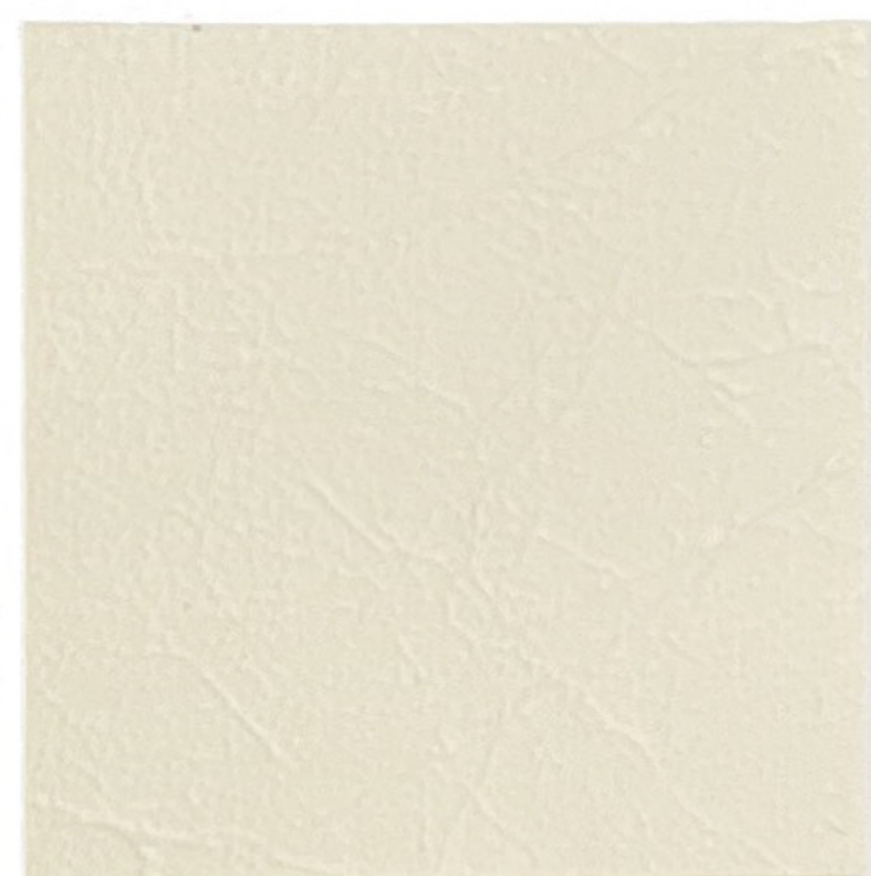
OX 25 Bone