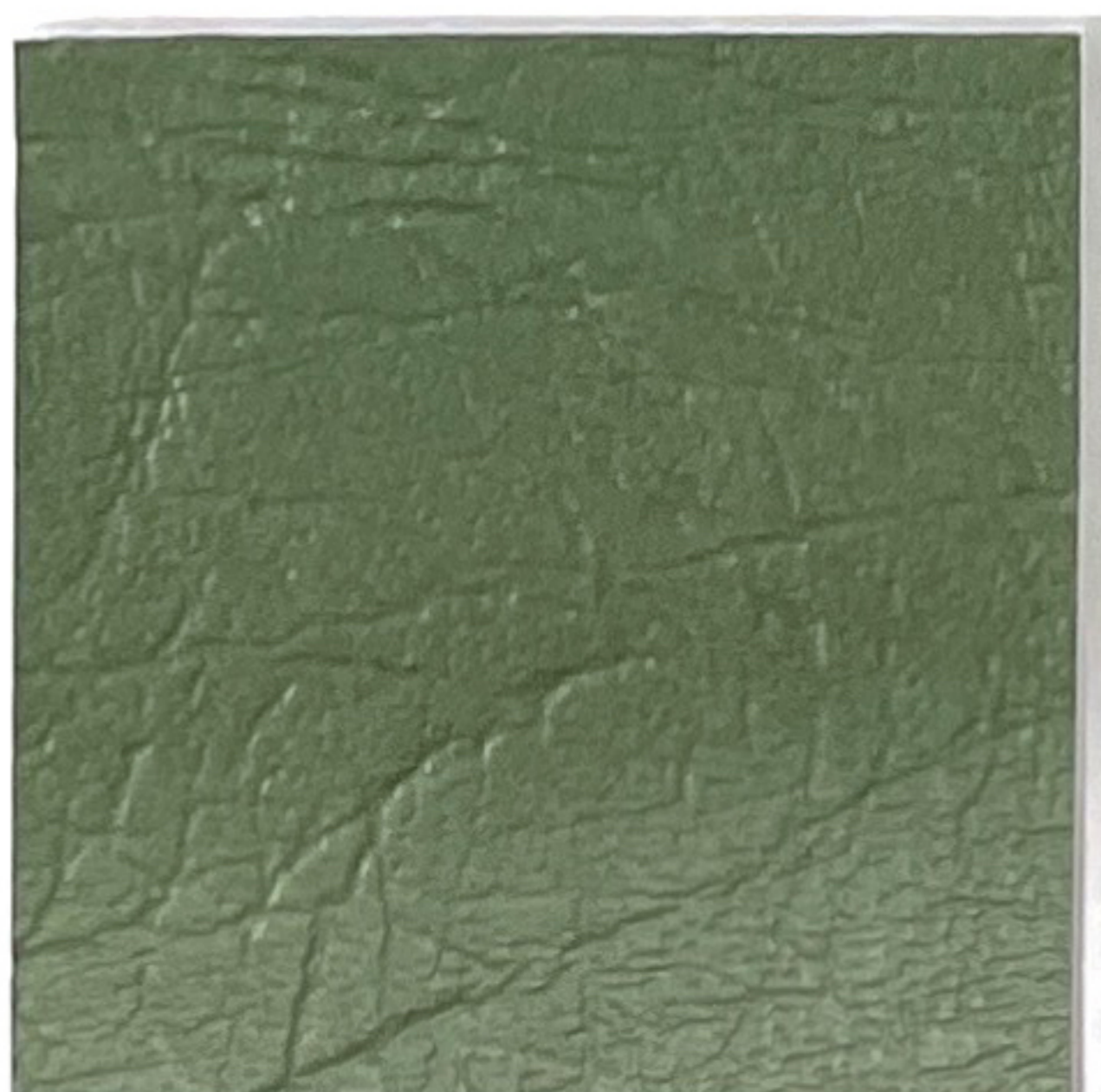
OX 30 Med. Green