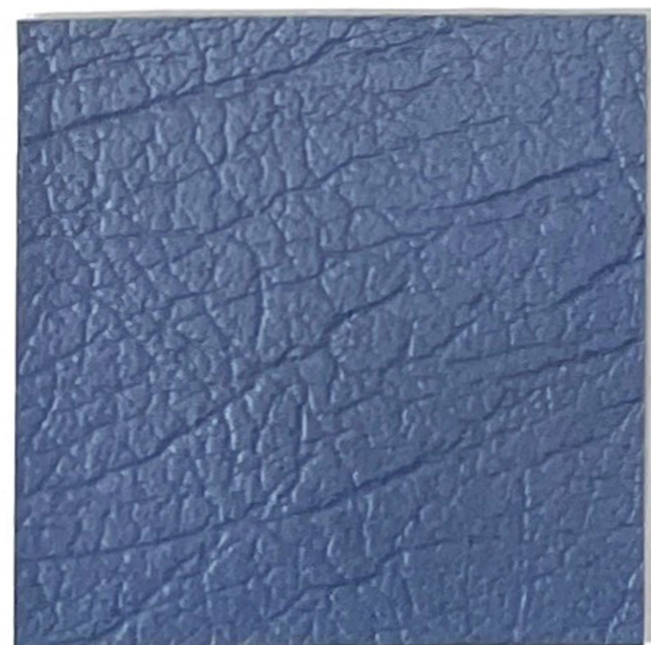
OX 23 Lt. Blue