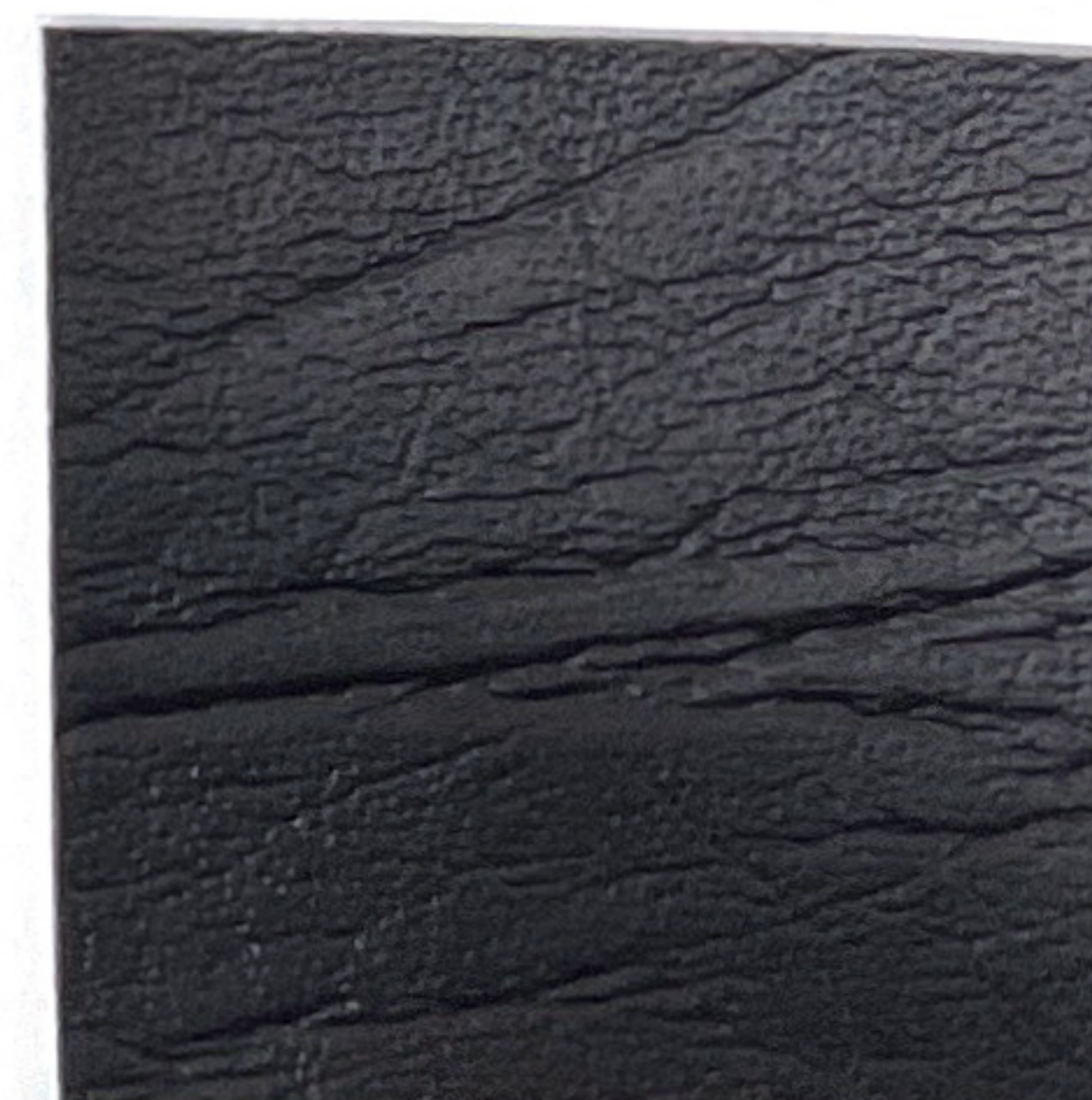
OX 22 Black