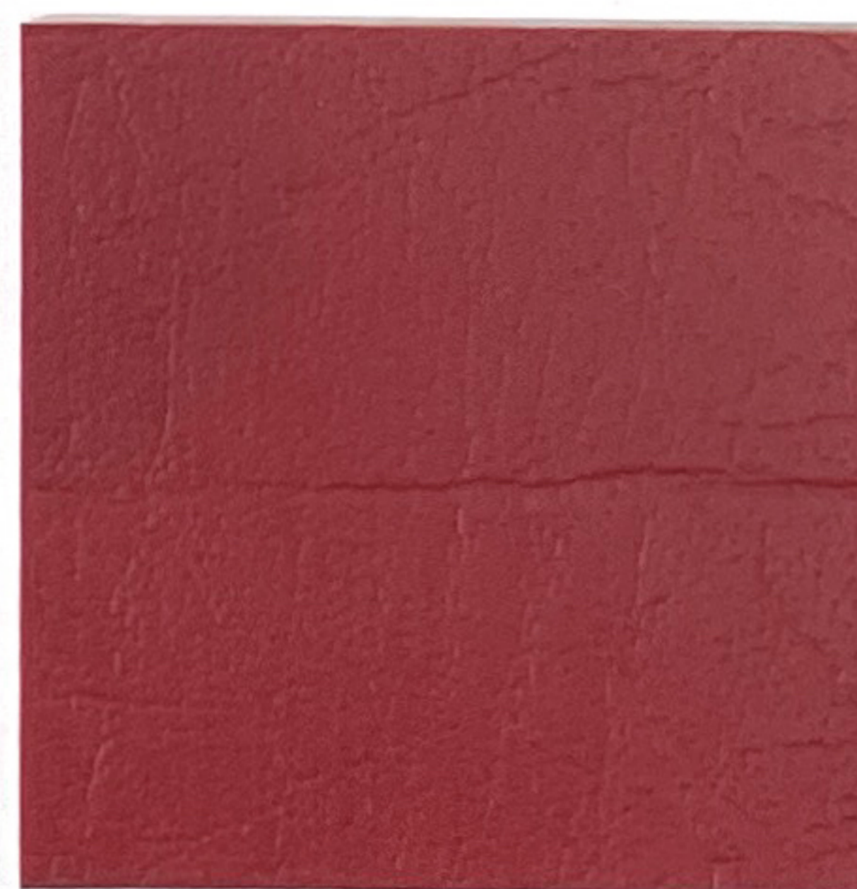
OX 33 Firethorn