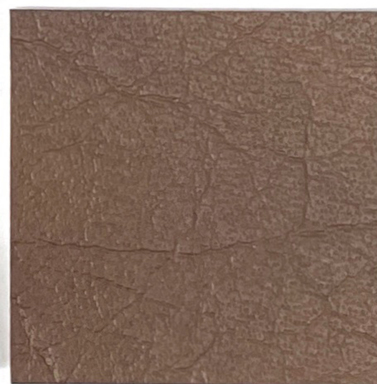
OX 21 Brown