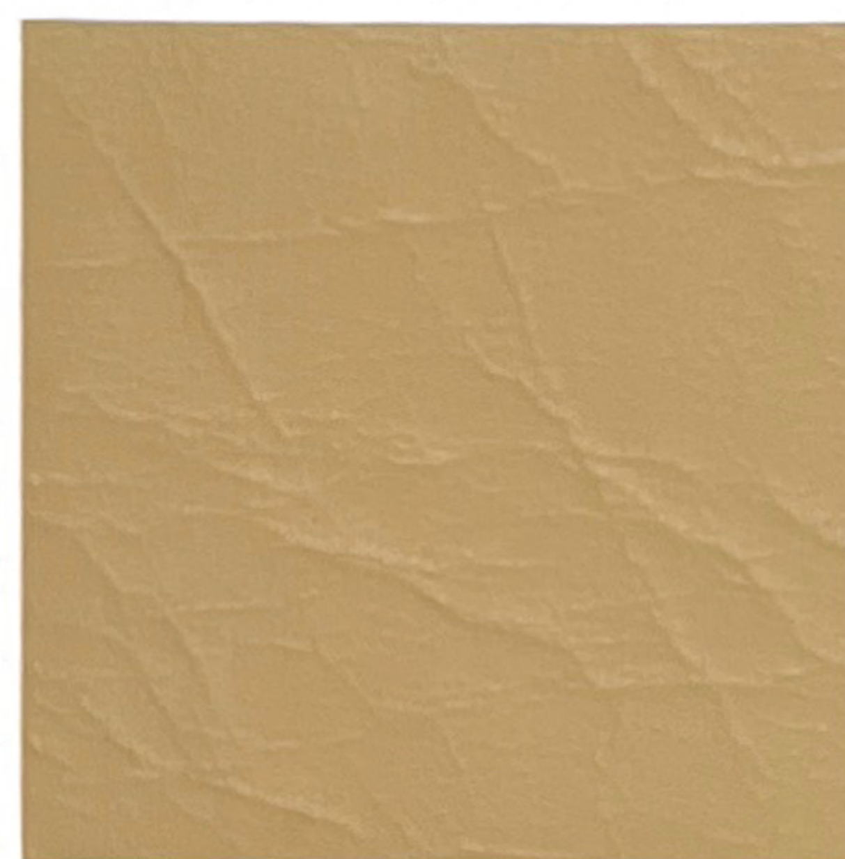
OX 24 Tan