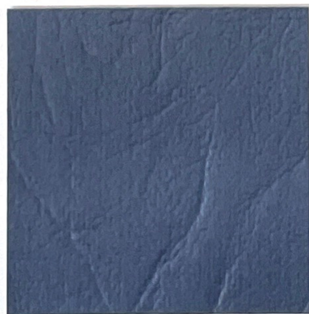
OX 34 Wedgewood Blue