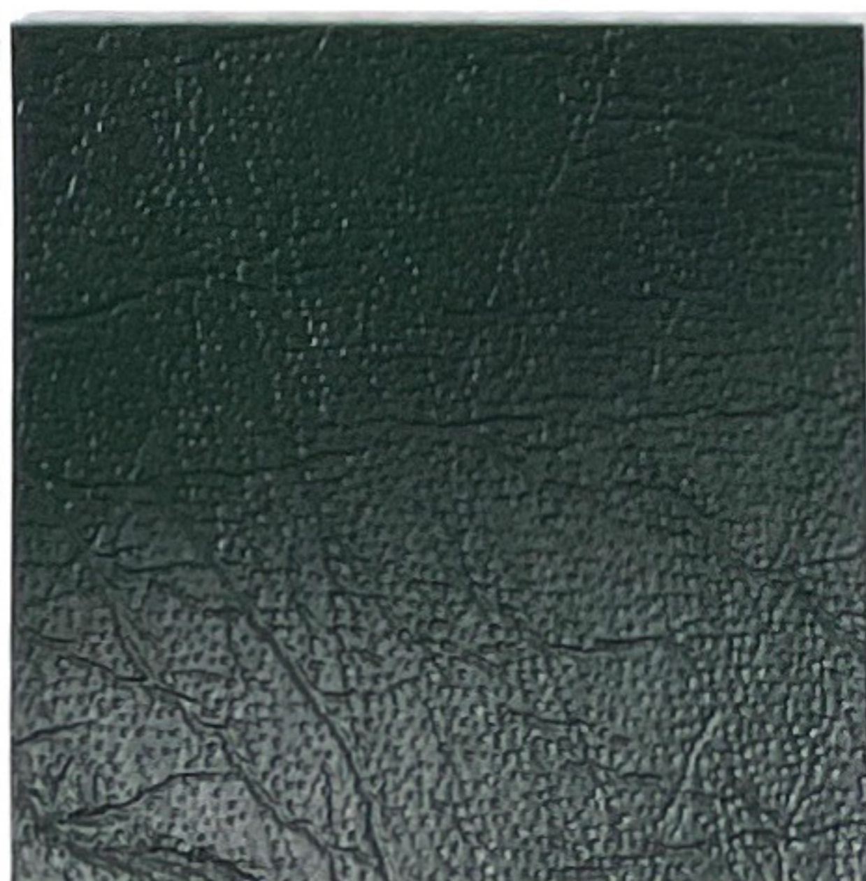
OX 28 Green