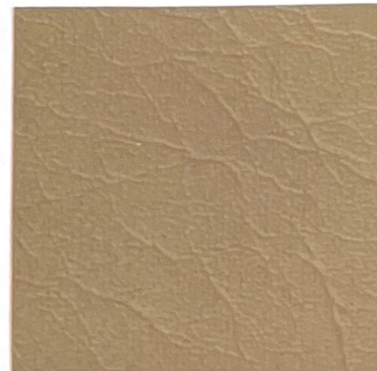
OX 32 Camel