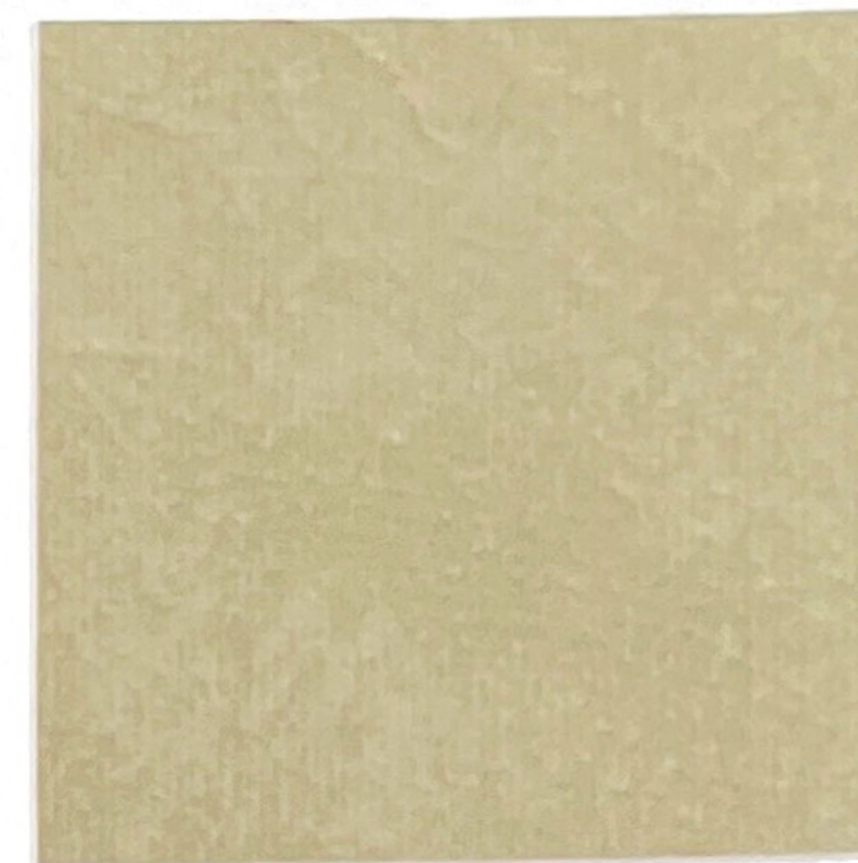
OX 27 Beige