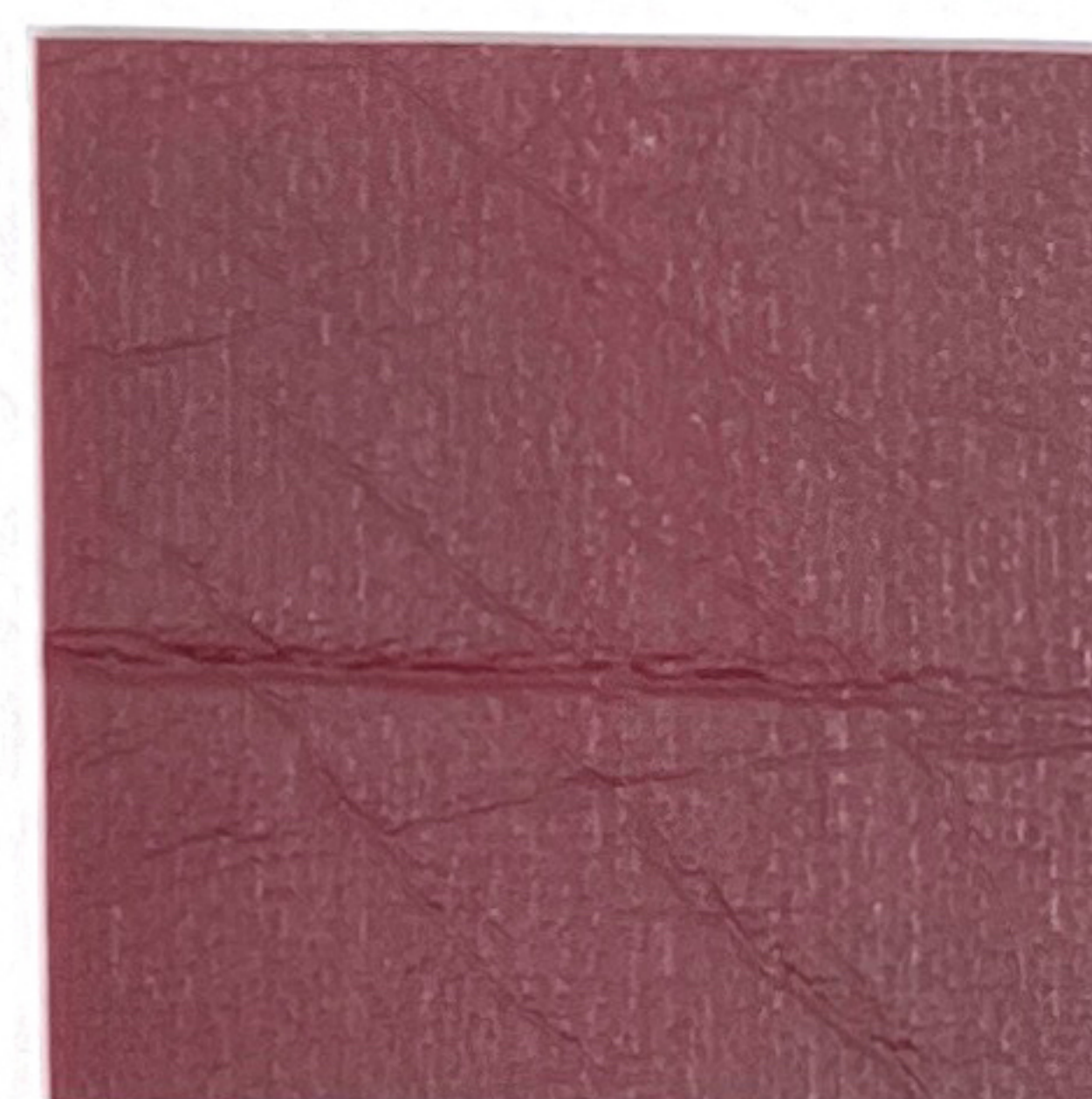
OX 26 Maroon