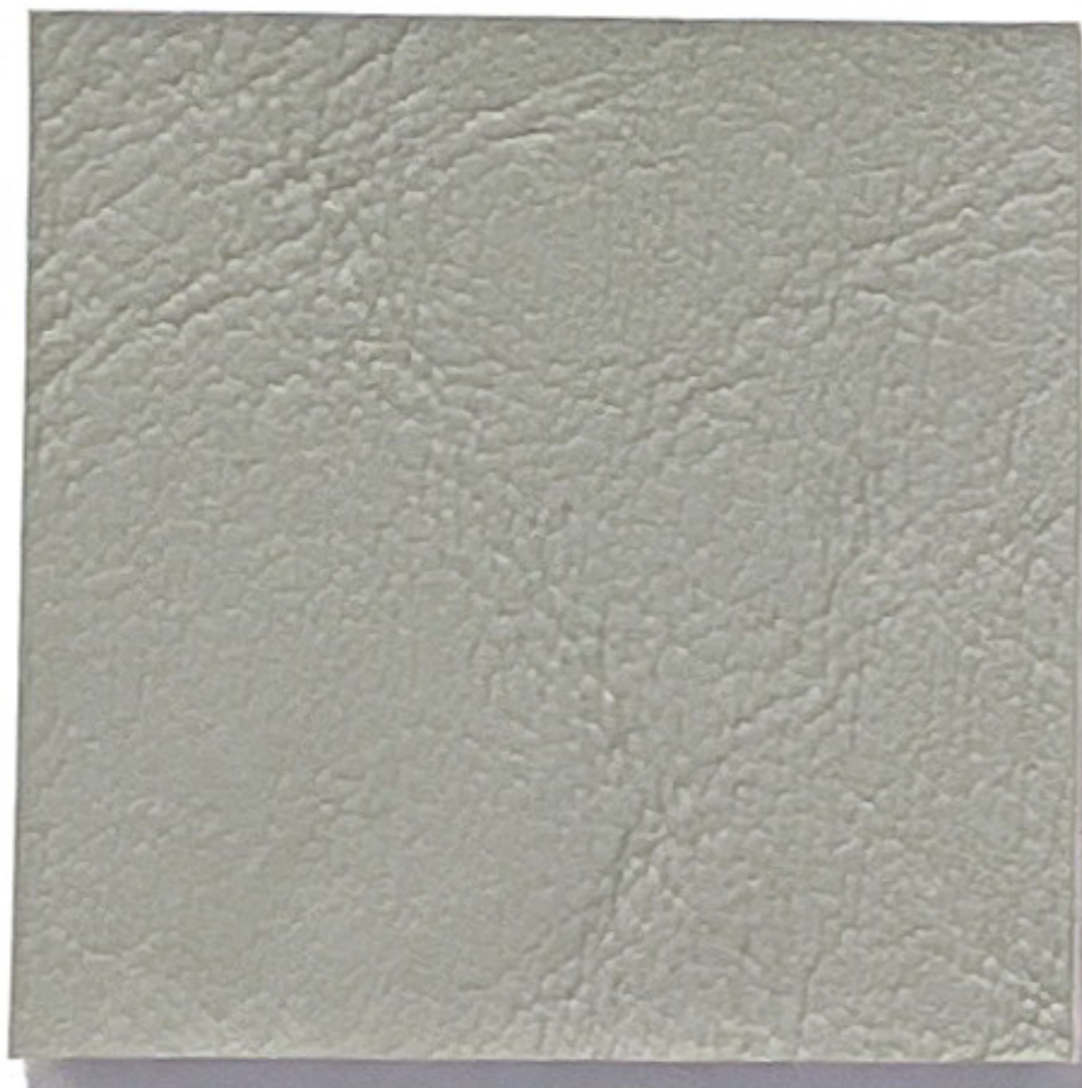
STA 12 Silver Ash