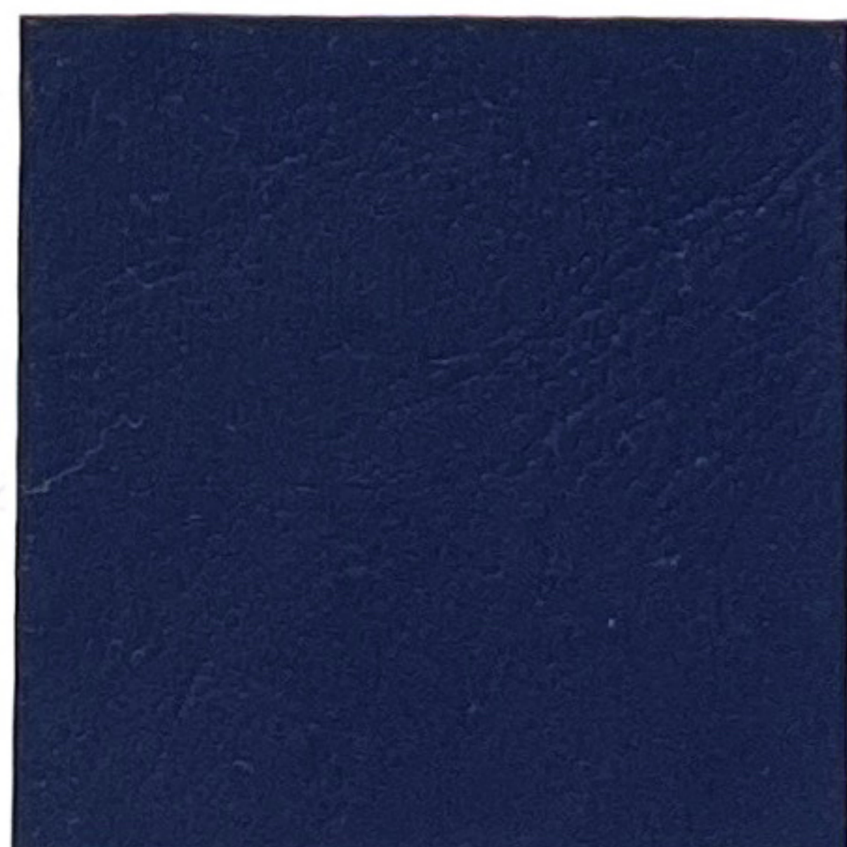
STA 20 Navy