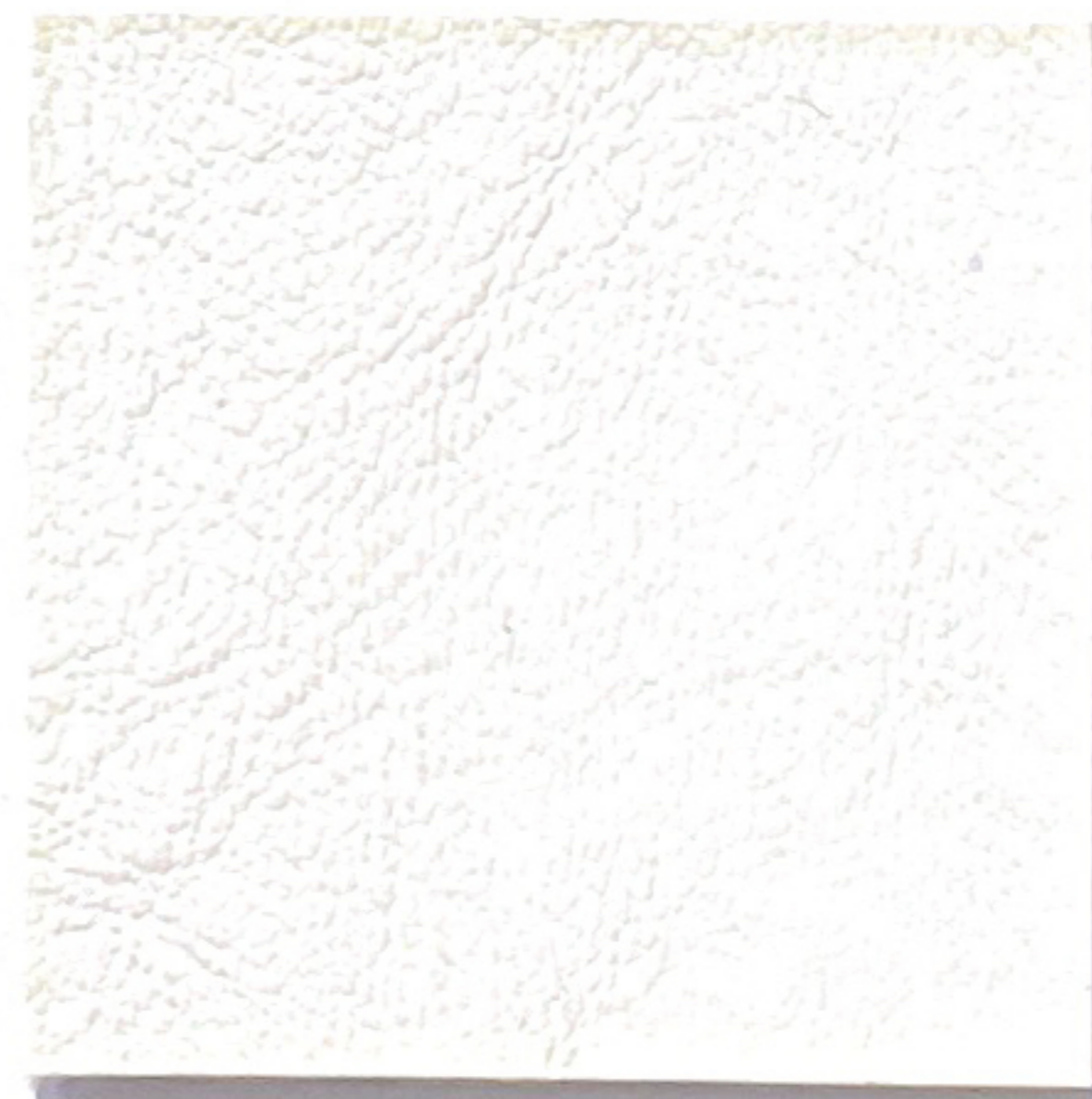
STA 11 White