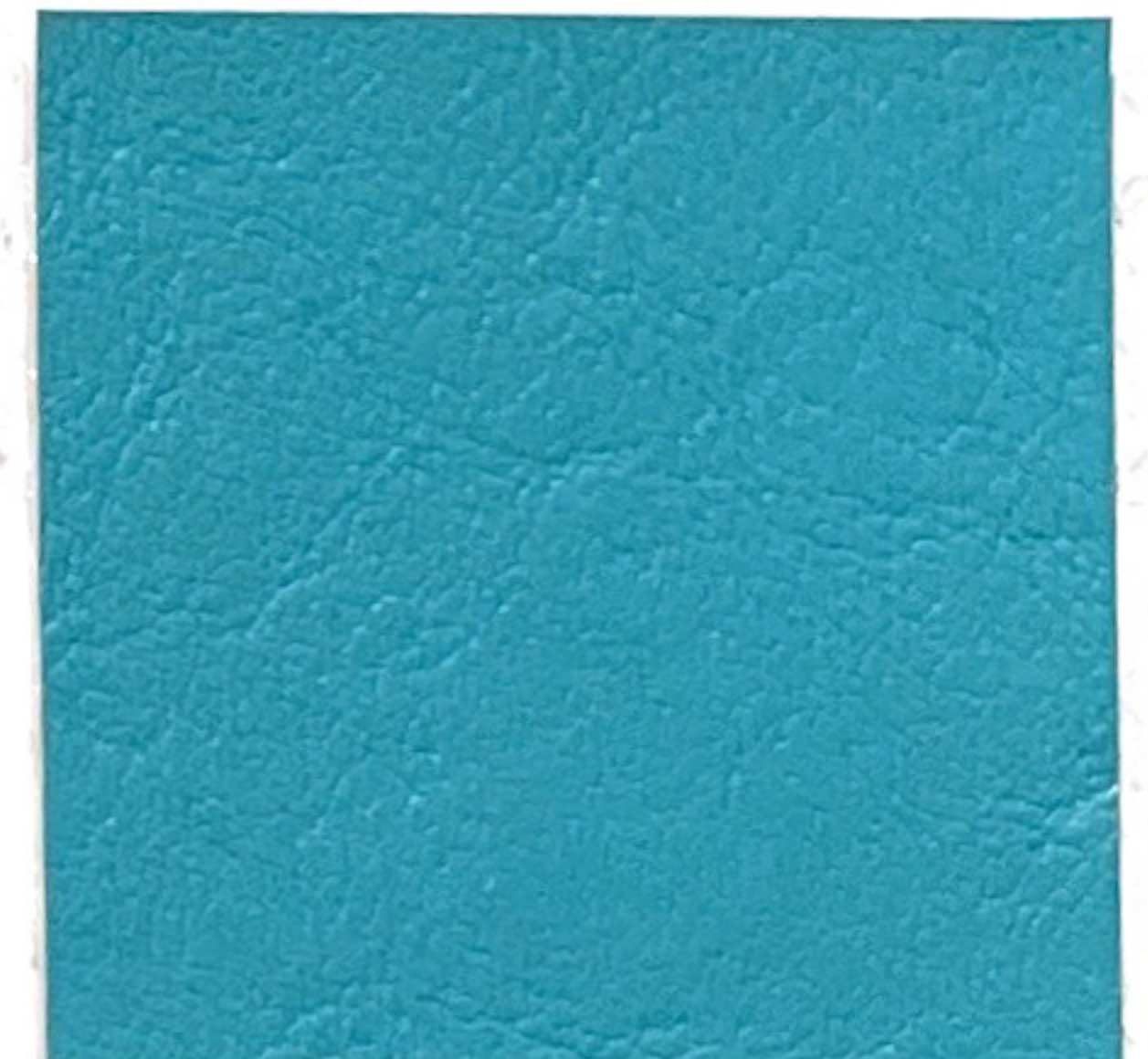
STA 14 Peacock