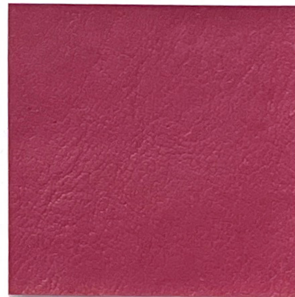
STA 18 Raspberry