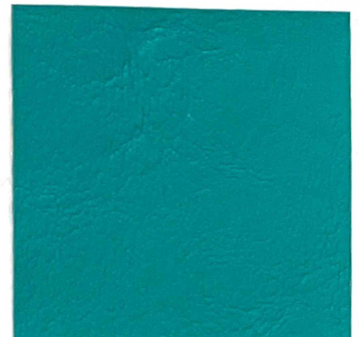
STA 13 Emerald