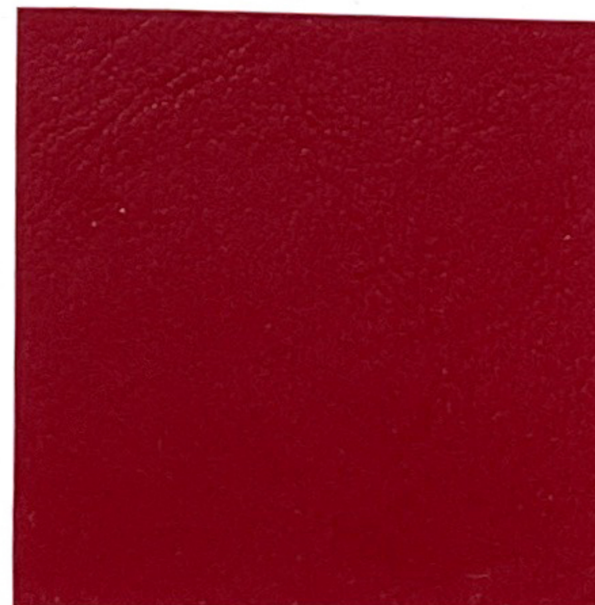
STA 15 Wine