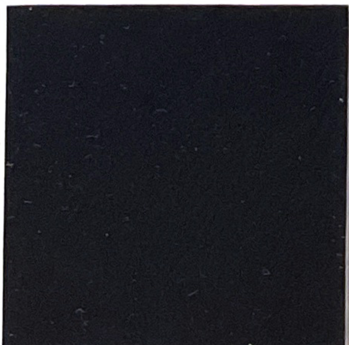
STA 22 Black