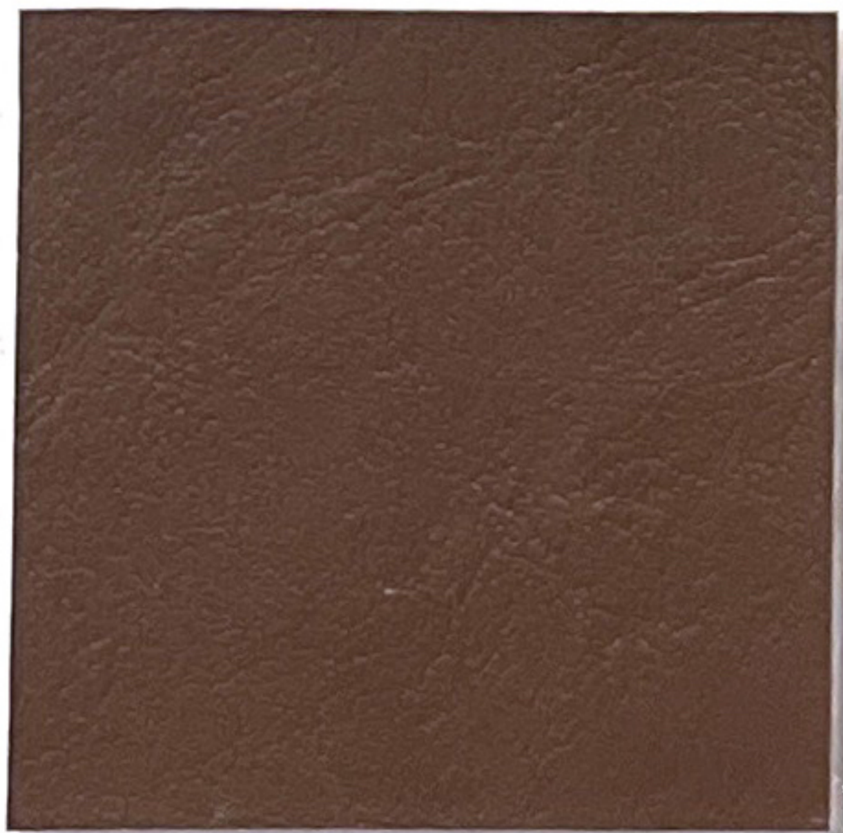
STA 21 Madder Brown