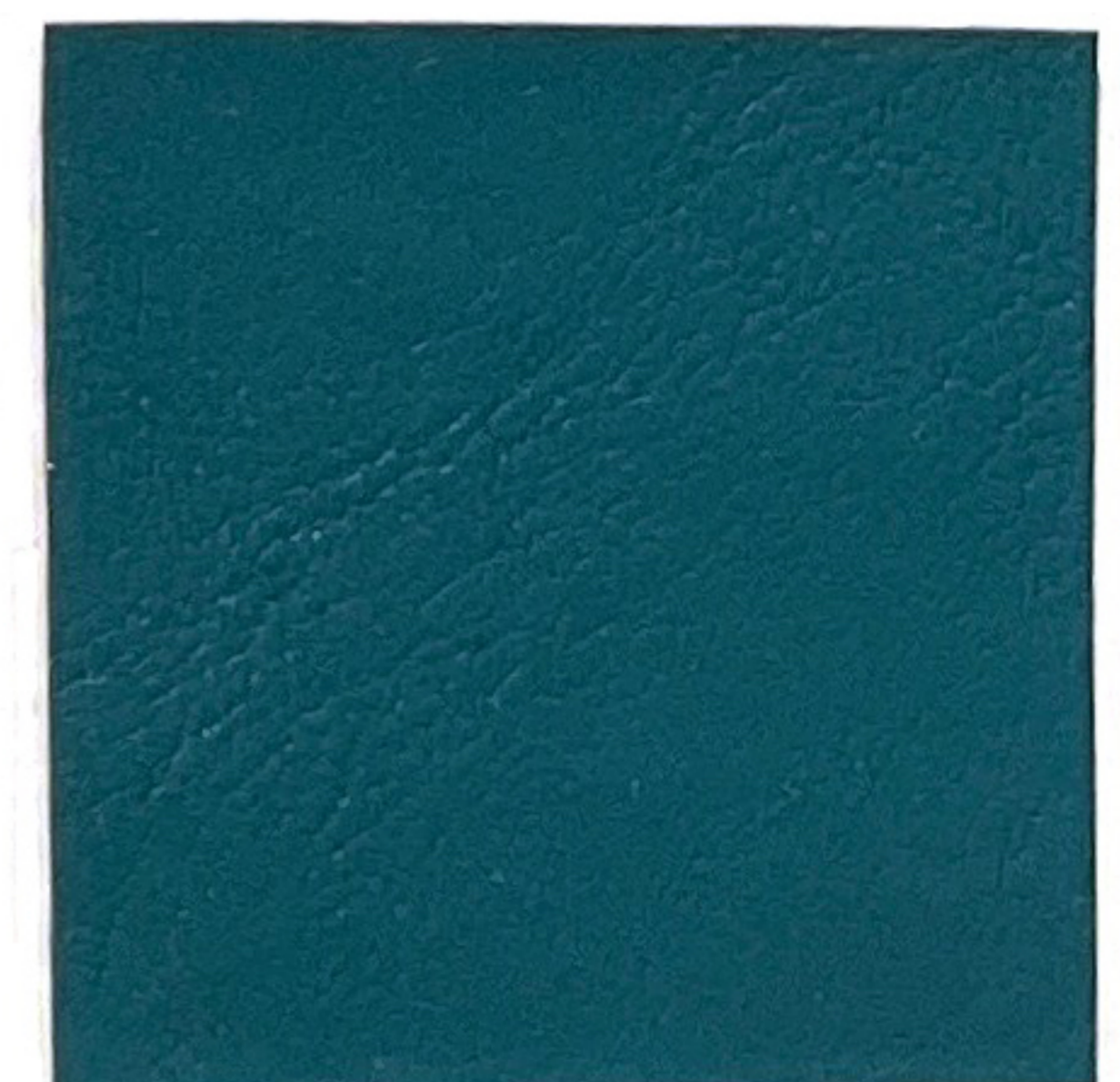
STA 16 Dark Teal